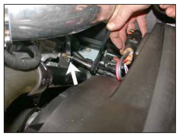
19. Secure the bracket using the provided hardware as shown.

18. Install the intake tube assembly into the silicone hose at the throttle body and slide the bracket onto the stock bolt as shown.