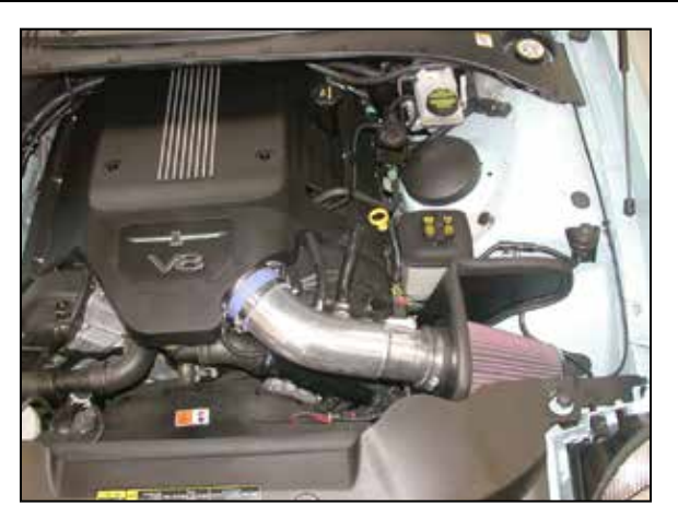
25. Reconnect the vehicle's negative battery cable. Double check to make sure everything is tight and properly positioned before starting the vehicle.

26. The C.A.R.B. exemption sticker, (attached), must be visible under the hood, so the emissions inspector can see it when the vehicle is required to be tested for emissions. California requires testing every two years, other states may vary.