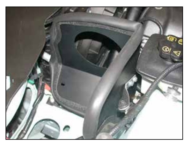
12. Install the heat shield into the vehicle and secure the bracket to the factory air box mount with the factory bolt removed in step #8.