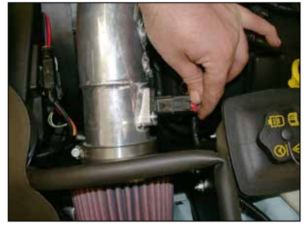
23. Reconnect the mass air sensor electrical connection.