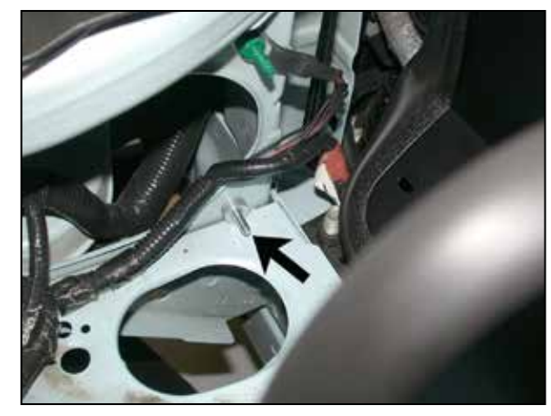
13. Install the provided 6mm bolt through the factory hole in the core support and then install the provided spacer onto the bolt as shown.