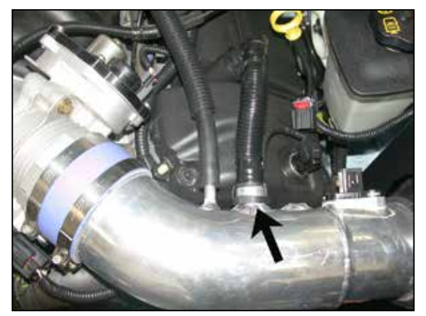
21. Install the large vent hose onto the intake tube as shown.

16. Using the "TORX" wrench provided, remove the mass air sensor from the air box lid as shown.