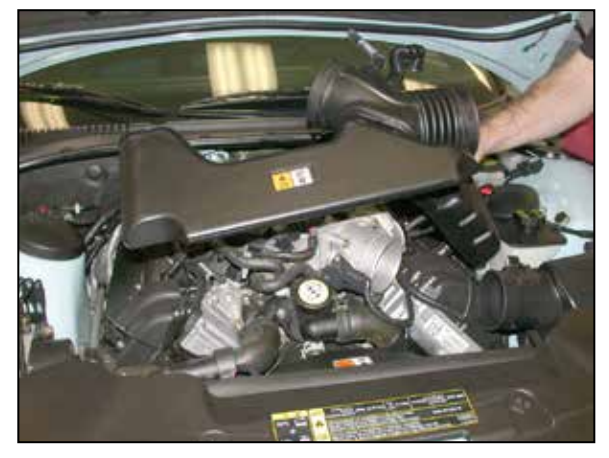
7. Remove the stock intake tube assembly from the vehicle.