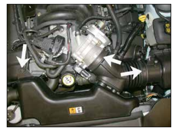
6. Loosen the hose clamps at the throttle body and the factory air box, and then remove the intake tube retaining nut shown.