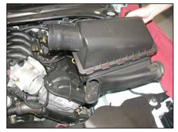
9. Pull up firmly on the air box to dislodge it from the retaining pin, and then remove the air box from the vehicle.

NOTE: K&N Engineering, Inc., recommends that customers do not discard factory air intake.