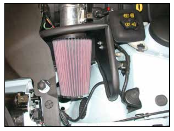
22. Install the air filter and secure with the provided hose clamp.