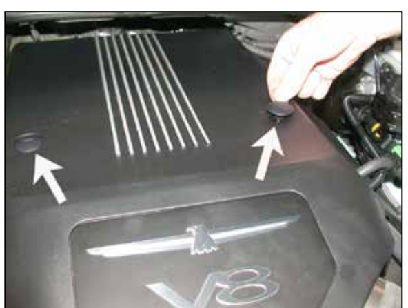
24. Reinstall the engine cover onto the rear retaining clips and then reinstall the retaining clips removed in step #2.