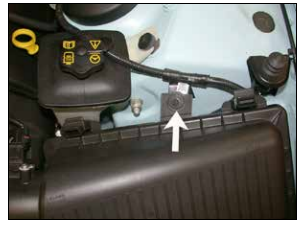
8. Remove the air box retaining bolt shown.