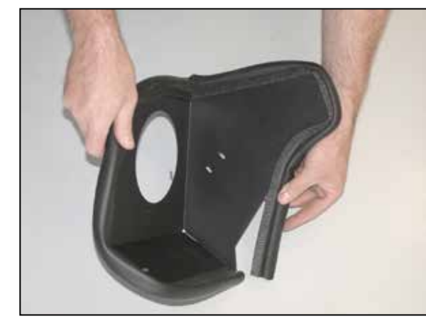
10. Install the provided edge trim onto the heat shield as shown.

NOTE: K&N Engineering, Inc., recommends that customers do not discard factory air intake.