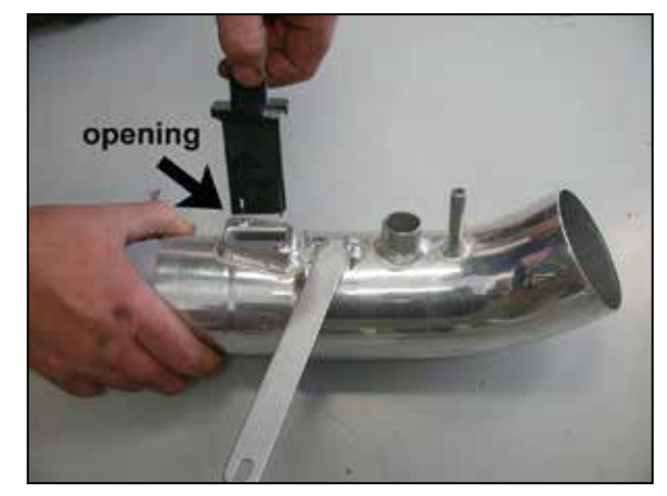
17. Install the mass air assembly into the intake tube and secure with the provided hardware. NOTE: Be sure to install with the opening of the mass air sensor towards the filter end of the tube as shown.