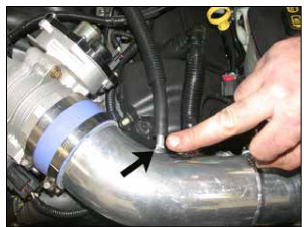
20. Install the small vent hose onto the intake tube as shown.