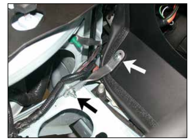
14. Install the provided heat shield bracket (010084) onto the bolt installed in step #14, and then fasten the bracket to the heat shield with the provided hardware.

NOTE: Use the supplied 1/4" washer as a spacer between the bracket and heat shield.