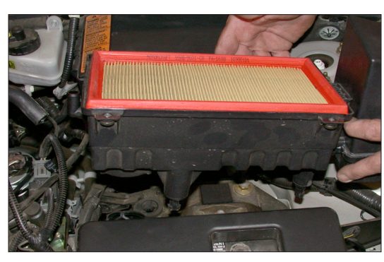
6. Pull firmly upwards to remove the lower air cleaner assembly as shown.

NOTE: K&N Engineering, Inc., recommends that customers do not discard factory air intake.