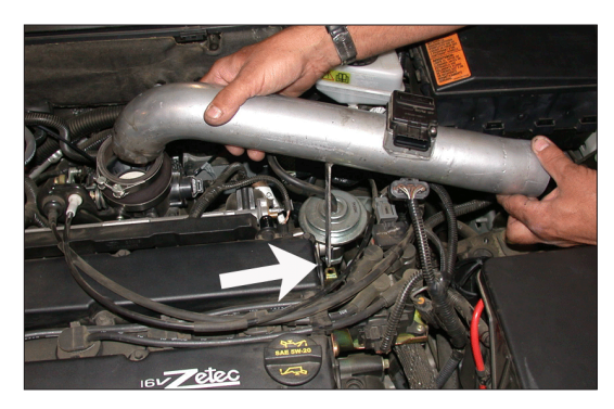
11. Install the K&N® Typhoon® intake tube into the silicone hose then line up the bracket with the ignition bracket and secure with the bolt from step 10. Tighten the hose clamps using the 9/64 allen wrench provided.