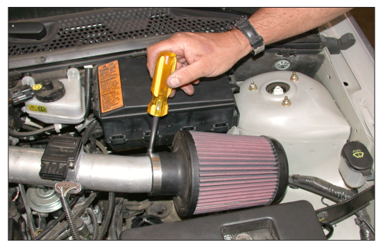
13. Install the K&N® air filter onto the K&N® Typhoon® intake tube and tighten with the provided hose clamp as shown.

NOTE: Drycharger® air filter wrap; part # RX-4730DK is available to purchase separately. To learn more about Drycharger® filter wraps or look up color availability please visit http://www. knfilters.com®.