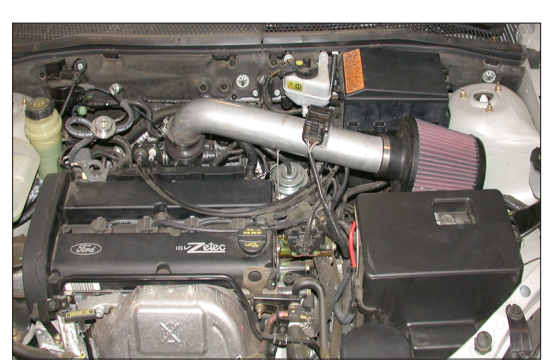
15. Reconnect the vehicle's negative battery cable. Double check to make sure everything is tight and properly positioned before starting the vehicle.