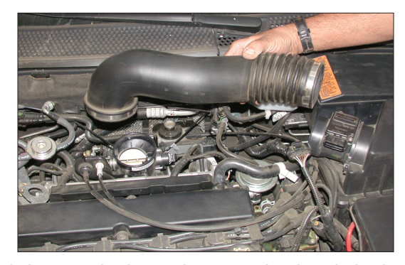
3. Loosen the hose clamps at the throttle body and at the mass air sensor, then, remove the stock intake tube as shown.