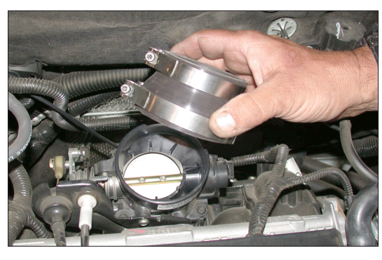
7. Install the provided silicone hose and hose clamps onto the throttle body as shown.

NOTE: K&N Engineering, Inc., recommends that customers do not discard factory air intake.