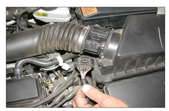
2. Disconnect the mass air sensor electrical connection as shown.

NOTE: Disconnecting the negative battery cable erases pre-programmed electronic memories. Write down all memory settings before disconnecting the negative battery cable. Some radios will require an anti-theft code to be entered after the battery is reconnected. The anti-theft code is typically supplied with your owner's manual. In the event your vehicles' anti-theft code cannot be recovered, contact an authorized dealership to obtain your vehicles anti-theft code.