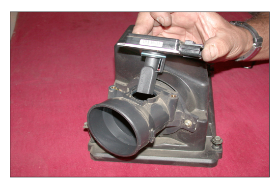
8. Remove the two bolts that secure the mass air sensor, then, remove the mass air sensor as shown.