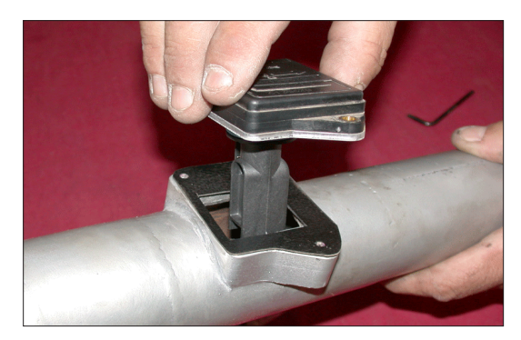
9. Install the mass air sensor into the K&N<sup>®</sup> Typhoon<sup>®</sup> intake tube using the stock bolts from step 8.

NOTE: Before installing the mass air sensor, inspect the inside of the tube for any debris, then clean the inside out with water and a towel. Inspect the tube one more time before proceeding to the next step.