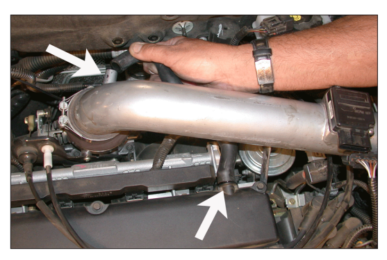
12. Using the provided vent hose, (Trim to fit), connect to the K&N® Typhoon® intake tube and valve cover as shown.