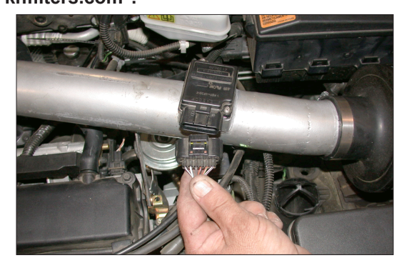
14. Reconnect the mass air sensor electrical connection as shown.

NOTE: Drycharger® air filter wrap; part # RX-4730DK is available to purchase separately. To learn more about Drycharger® filter wraps or look up color availability please visit http://www. knfilters.com®.