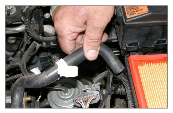
5. Remove the vent hose from the side of the lower air cleaner and valve cover.