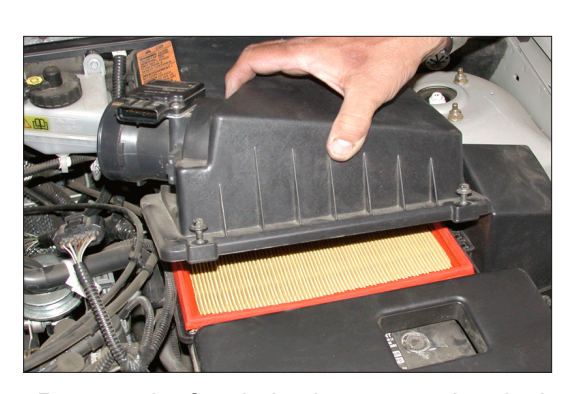
4. Remove the four bolts that secure the air cleaner cover, then remove the cover and filter as shown.