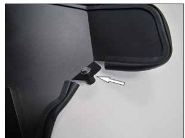
8. Install the nut insert onto the heat shield and secure with the provided hardware.