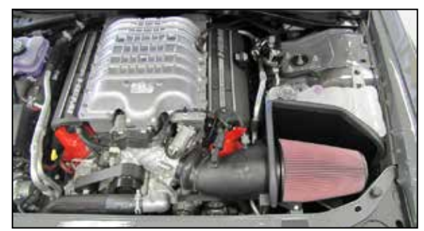
17. Reconnect the vehicle's negative battery cable. Double check to make sure everything is tight and properly positioned before starting the vehicle.

16. Install the K&N ^{\odot} air filter onto the filter adapter and secure with the provided hose clamp.