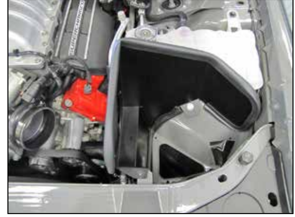
12. Install the provided coupling hose (KITHUMPHS12) onto the throttle body and secure with the provided hose clamp. Set the heat shield into position on the inner fender but do not secure at this time.

thread. Install the vent fitting "hand" tight, then turn it two complete turns with a wrench.