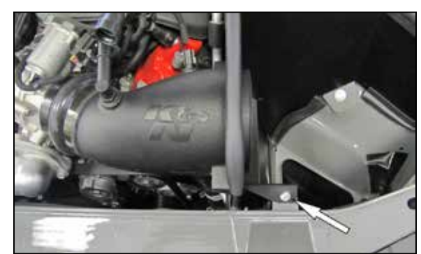
14. Secure the heat shield to the core support with