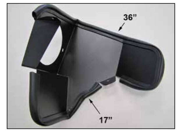
7. Install the edge trim onto the heat shield as shown.