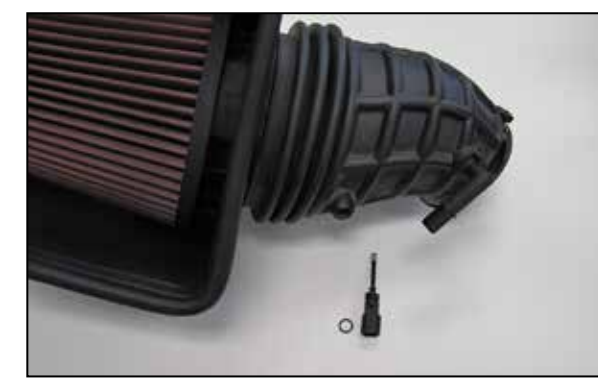
9. Remove the inlet air temperature sensor from the factory intake tube.

NOTE: Use care while handling the inlet air temperature sensor as it is very fragile.