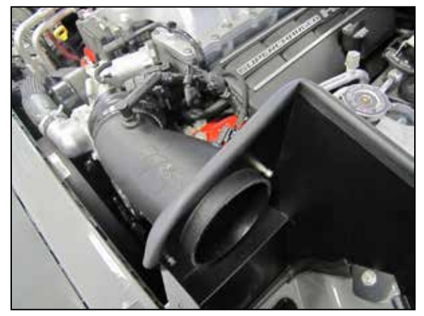
13. Install the K&N<sup>®</sup> intake tube into the coupling hose and heat shield and secure with the provided hardware to the heat shield.