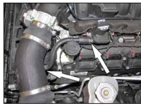
21. Install the assembled vent hose onto the fitting installed in the K&N® intake tube and then attach the open end to the valve cover port and secure with the provided hose clamp.