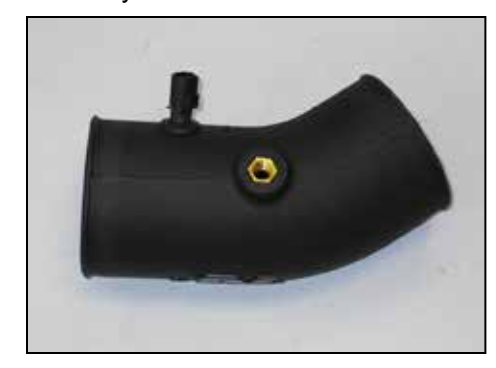
16. Install the provided grommet and the factory inlet air temperature sensor into the K&N® intake tube as shown.