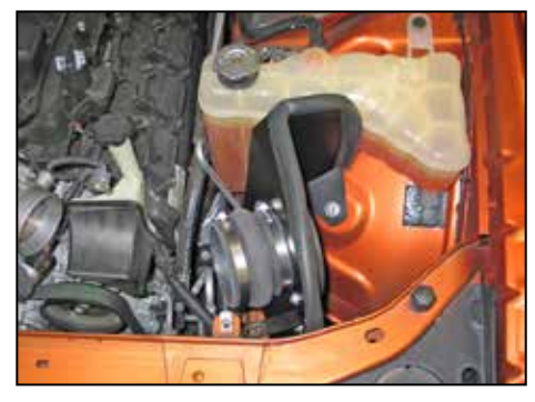
13. Set the heat shield assembly into position in the engine bay so the rubber insert passes into the air box mounting hole in the inner fender. Do not secure the heat shield at this time.