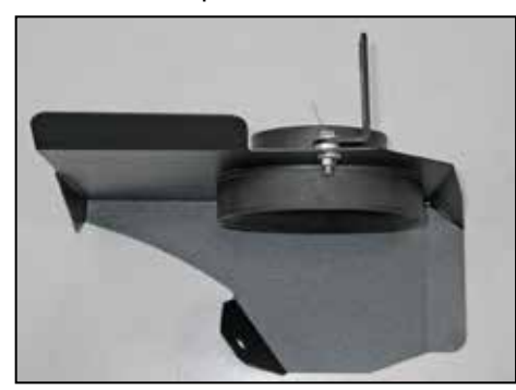
9. Install the provided heat shield mounting bracket (070742) along with the spacer onto the heat shield as shown.