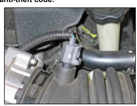
2. Disconnect the inlet air temperature air sensor electrical connection.

NOTE: Disconnecting the negative battery cable erases pre-programmed electronic memories. Write down all memory settings before disconnecting the negative battery cable. Some radios will require an anti-theft code to be entered after the battery is reconnected. The anti-theft code is typically supplied with your owner's manual. In the event your vehicles' anti-theft code cannot be recovered, contact an authorized dealership to obtain your vehicles anti-theft code.