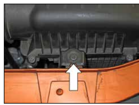
6. Remove the bolt that secures the air box to the core support.