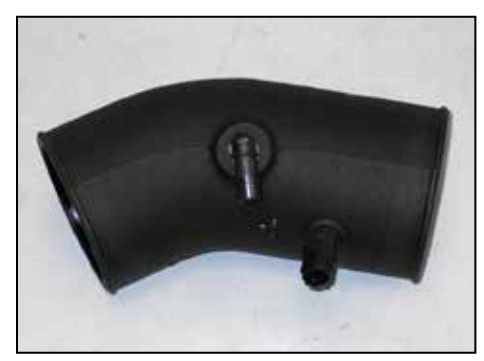
17. Install the provided 90° vent fitting into the K&N® intake tube as shown.