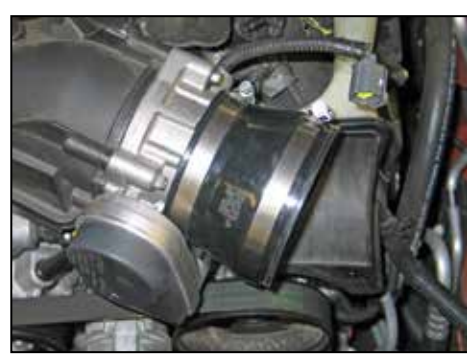
14. Install the silicone step hose (08497) onto the throttle body and secure with the provided hose clamp.