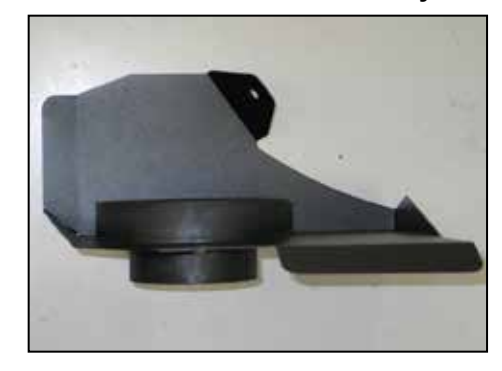
8. Install the filter adapter into the heat shield and secure with the provided hardware.

NOTE: K&N Engineering, Inc., recommends that customers do not discard factory air intake.