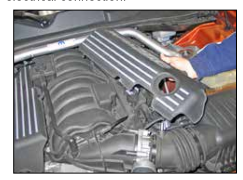
3. Lift up and remove the driver side ignition coil cover as shown.