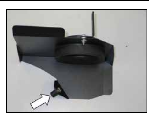
10. Install the provided rubber insert onto the heat shield as shown and secure with the provided hardware.