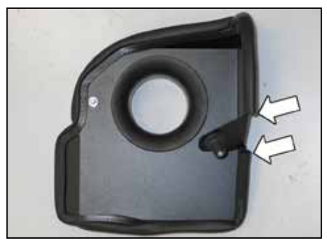
11. Install the provided edge trim onto the heat shield as shown.