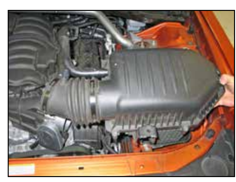
7. Lift up and remove the complete intake track from the vehicle.

NOTE: K&N Engineering, Inc., recommends that customers do not discard factory air intake.