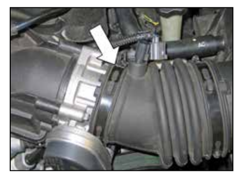
5. Loosen the hose clamp securing the intake tube to the throttle body.