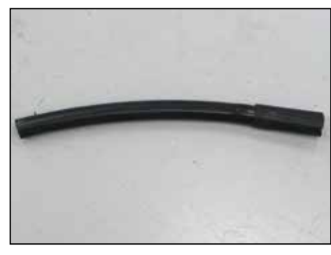
20. Assemble the two vent lines together using the provided hose mender.