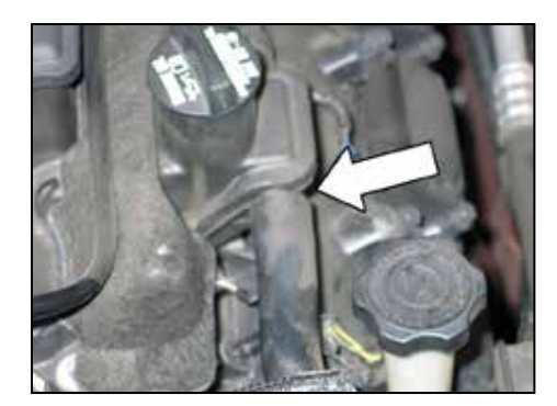
4. Disconnect the crank case vent hose from the valve cover.