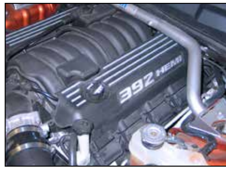
23. Reinstall the coil cover.