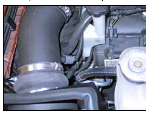
22. Reconnect the inlet air temperature sensor electrical connection.