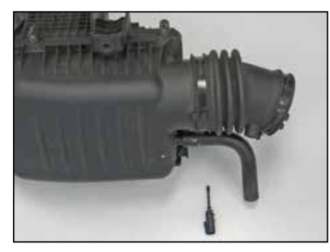
15. Remove the inlet air temperature sensor from the factory intake tube as shown.