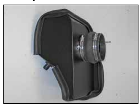
12. Install the provided silicone hump hose (08418) onto the filter adapter and secure with the provided hose clamp.