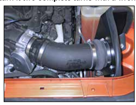
18. Install the K&N® intake tube into the silicone hump hose and then into the silicone step hose at the throttle body. Align the intake tube and heat shield for proper fit and then secure the intake tube with the provided hose clamps and the heat shield bracket with the factory air box retaining bolt removed in an earlier step.