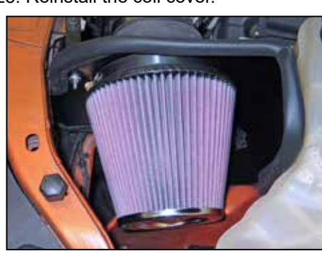
24. Install the K\&N^{\odot} air filter and secure with the provided hose clamp.

NOTE: Drycharger® air filter wrap; part # RF-1042DK is available to purchase separately. To learn more about Drycharger® filter wraps or look up color availability please visit http://www.knfilters.com®.