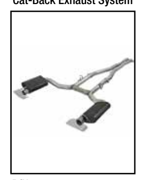
P/N: 49-32062 (Challenger Only!)