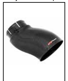
P/N: 54-72203-SF (Carbon)