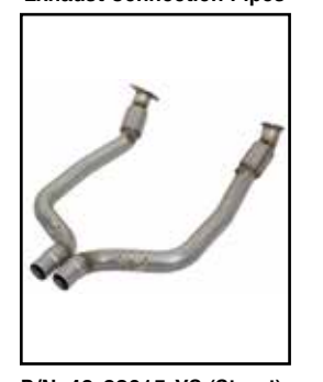
P/N: 48-32015-YC (Street) 48-32015-YN (Race)