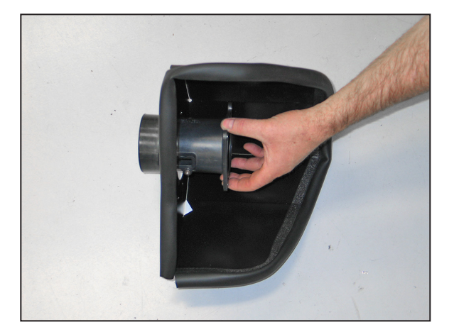
10. Pass the mass air sensor housing through the heat shield as shown.