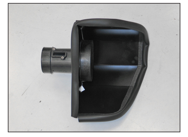
11. Using the provided hardware, assemble the mass air sensor housing and radiused filter adapter with heat shield together as shown.