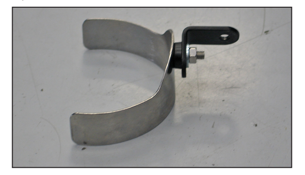
13. Using the provided hardware, install the saddle clamp onto the "L" bracket (070066) as shown. NOTE: The slotted end of the "L" bracket will attach to the saddle clamp.