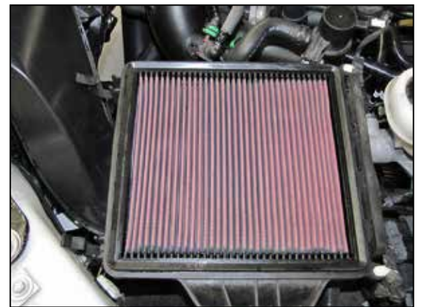
5. Install the provided K&N® air filter, reinstall the upper air filter housing and secure with the factory clips.