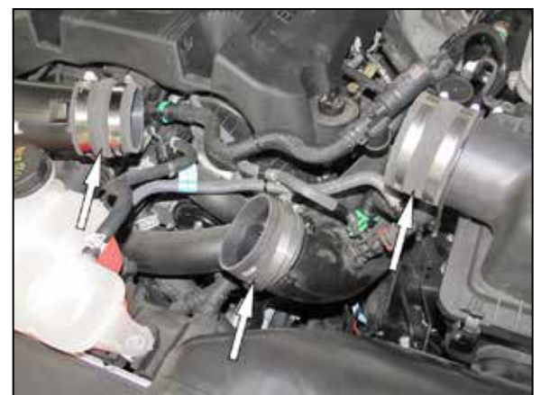
6. Install the provided coupler hoses onto the turbo inlet tubes and air filter housing and secure with the provided hose clamps.