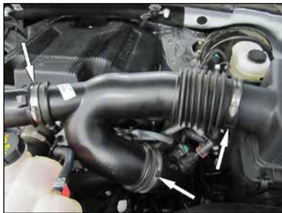
3. Loosen the three hose clamps that secure the factory intake tube and then remove the intake tube from the vehicle. NOTE: K&N Engineering, Inc., recommends that customers do not discard factory air intake.