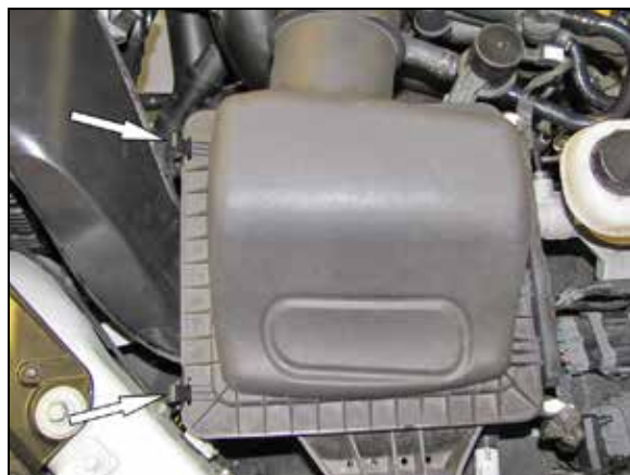
4. Release the two clips that secure the upper air filter housing and then remove the housing and factory air filter.