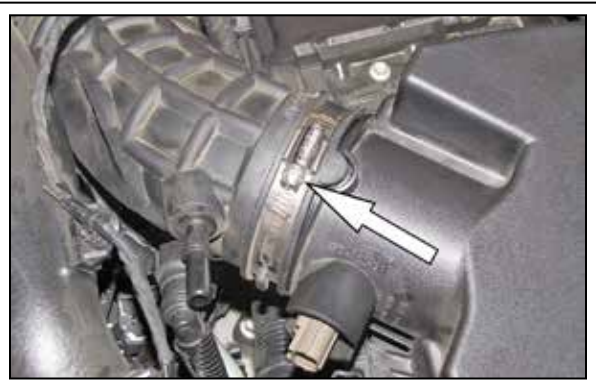
4. Loosen the hose clamp securing the intake tube to the air filter housing.