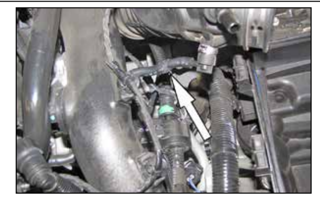
6. Disconnect the solenoid vent hose from the fitting installed into the factory intake tube.