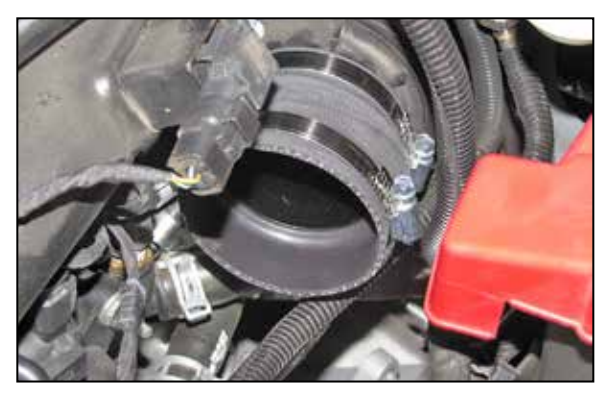
8. Install one of the hump hoses (087121) onto the turbo inlet and secure with the provided hose clamp.