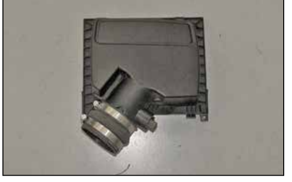
16. Install the remaining hump hose (087121) onto the factory air box as shown and secure with the provided hose clamp.