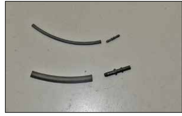
10. Install the provided union fittings into the provided vent hoses as shown.

NOTE: Plastic NPT fittings are easy to cross thread. Install the vent fitting "hand" tight, then turn it two complete turns with a wrench.