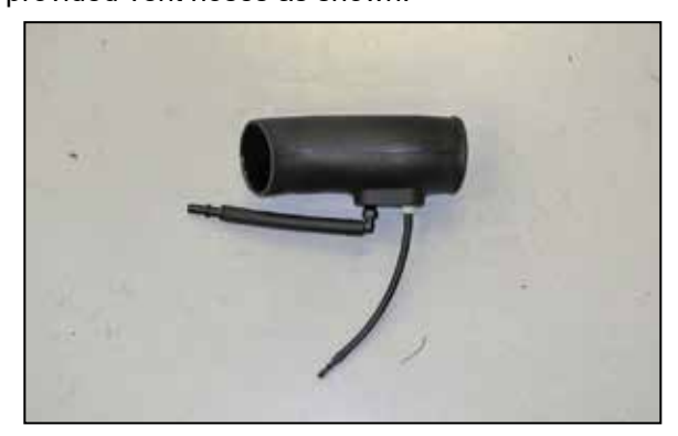
11. Install the vent hose assemblies onto the fittings installed into the K&N ^{\odot} intake tube.