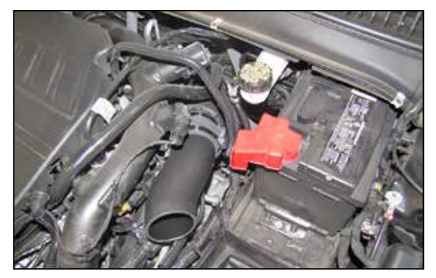
13. Install the K&N ^{\odot} intake tube into the coupling hose at the turbo but do not tighten at this time.

12. Set the intake tube in and then connect the solenoid vent hose to the hose installed onto the K\&N^{\otimes} intake tube.