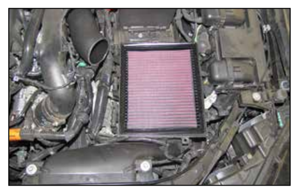
15. Install the K&N® air filter.

14. Connect the factory crank case vent hose to the quick connect fitting/vent hose installed into the K&N<sup>®</sup> intake tube.