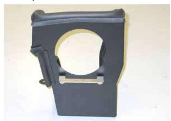
9. Install the tube mounting bracket (06712) onto the heat shield using the provided hardware and spacers.