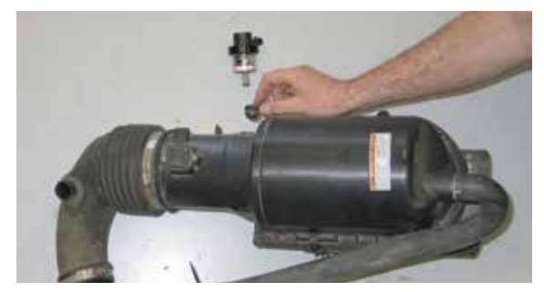
14. Remove the filter minder and grommet from the factory air filter housing as shown.