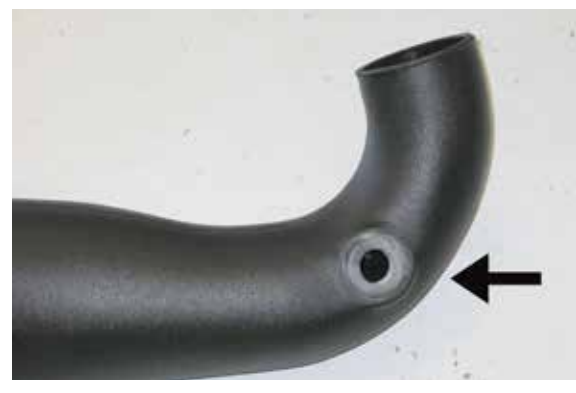
16. Install the supplied crank case grommet into the K&N® intake tube as shown.