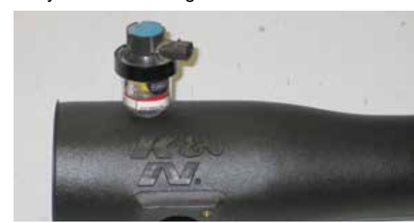
15. Install the filter minder and grommet into the K&N® intake tube as shown.