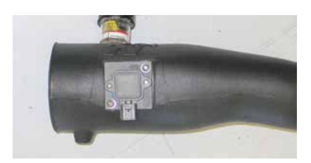
20. Install the mass air sensor assembly onto the K&N® intake tube as shown and secure with the provided hardware as shown.