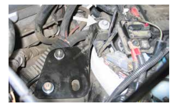
12. Remove the battery tray mounting bolt shown. NOTE: This bolt will be reused.