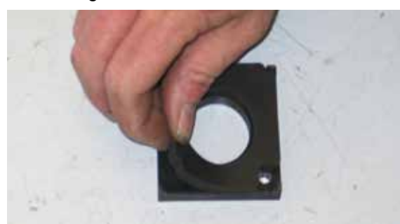
18. Install the provided gasket onto the K&N® mass air sensor adapter.