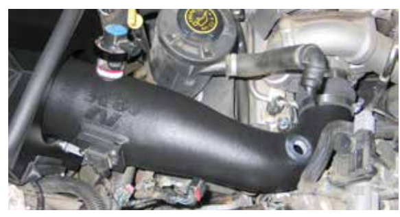
22. Install the K&N® intake tube assembly into the heat shield and slide the silicone hose onto the turbo inlet. Secure the intake tube to the mounting bracket on the heat shield with the provided hardware and then position the silicone hose onto the turbo and secure with the hose clamps.