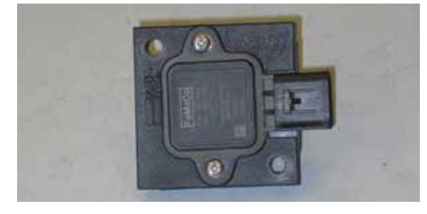
19. Install the mass air sensor into the K&N® mass air sensor adapter and secure with the provided hardware.