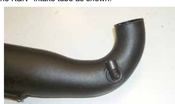
16a. On models that have the crank case vent fitting attached to the stock intake tube, install the supplied 90° vent fitting into the grommet as shown.