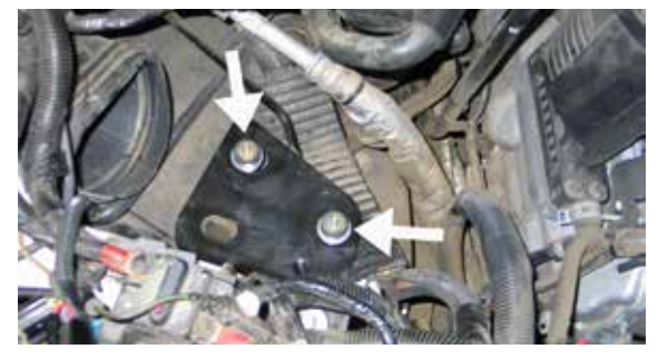
11. Install the provided rubber mounted studs onto the heat shield mounting tray using the provided hardware