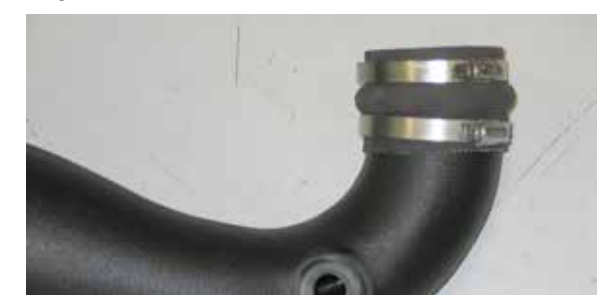
21. Install the provided silicone (087121) hose onto the K&N<sup>®</sup> intake tube with the hose clamps provided as shown.