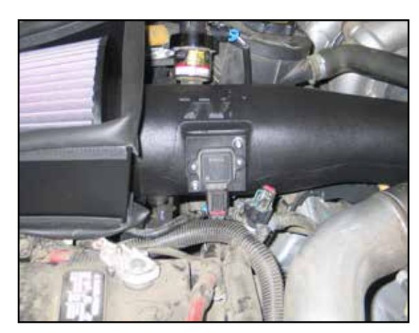
26. Reconnect the mass air sensor electrical connection.