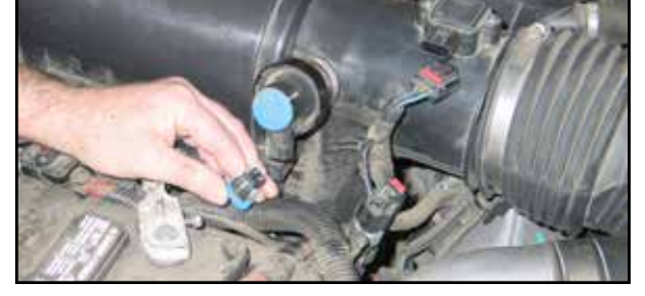
3. Disconnect the filter minder electrical connection.

2. Disconnect the mass air sensor electrical connection and unclip the wiring harness from the air box as shown.