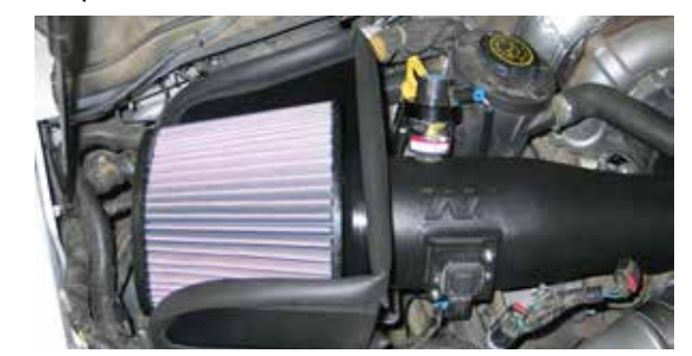
25. Install the K&N® Air Filter onto the K&N® intake tube and secure with the hose clamp.