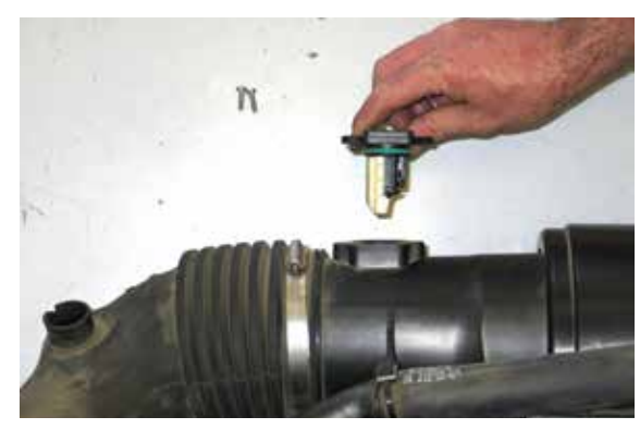
17.Remove the mass air sensor from the factory air filter housing.