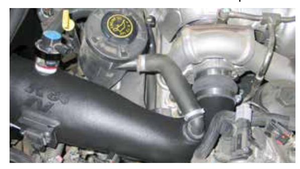
23. Insert the crank case vent fitting into the grommet in the K\&N^{\mbox{\tiny @}} intake tube.