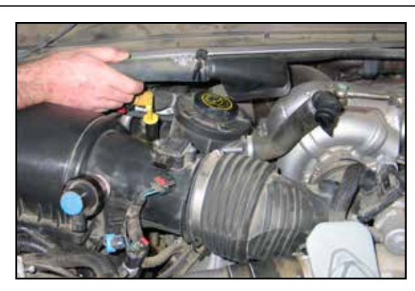
6. Unhook the warm air inlet tube from the fire wall as shown.