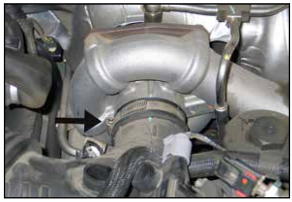
5. Loosen the hose clamp which secures the intake tube to the turbo inlet.

NOTE: On some models, the vent fitting is attached to the intake tube and is not removable. In this case remove the vent tube from the fitting.