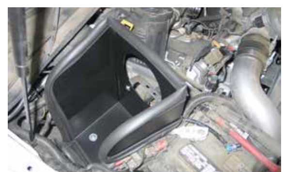
13. Install the heat shield assembly into position so that the rubber mounted studs protrude through bottom of the heat shield. Secure the heat shield with the provided hardware and the factory battery tray bolt removed in step #12.