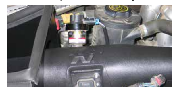
24. Attach the filter minder extension harness provided into the factory harness and then connect the open end to the filter minder.