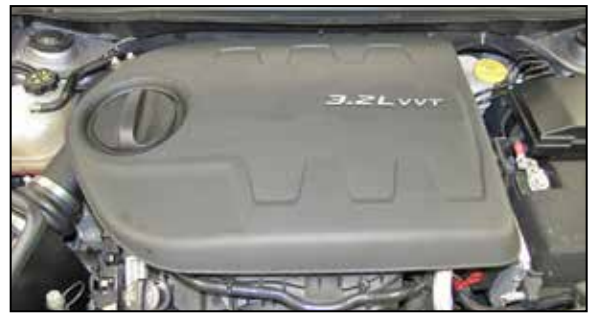
21. Reinstall the decorative engine cover.