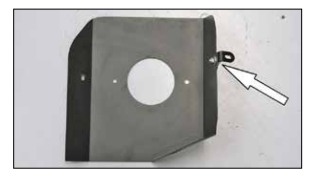
7. Install the heat shield mounting bracket (064323) onto the heat shield as shown using the provided hardware.