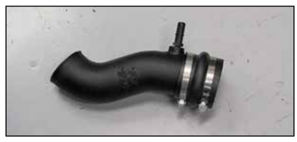
16. Install the provided hump coupler (5-576) all the way onto the K&N ^{\odot} intake tube but do not secure at this time.

NOTE: Plastic NPT fittings are easy to cross thread. Install the vent fitting "hand" tight, then turn it two complete turns with a wrench.