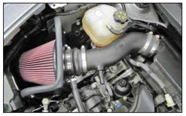
17. Install the K&N<sup>®</sup> intake tube into the coupler at the intake plenum and then slide the hump coupler onto the filter adapter. Adjust the intake tube for best fit and then secure with the provided hose clamps and heat shield mounting hardware.