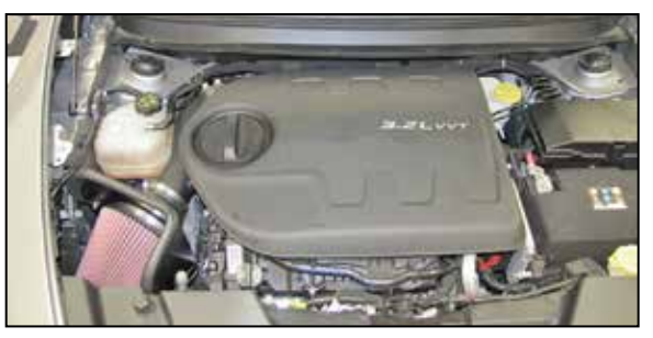
22. Reconnect the vehicle's negative battery cable. Double check to make sure everything is tight and properly positioned before starting the vehicle.

23. The C.A.R.B. exemption sticker, (attached), must be visible under the hood so that an emissions inspector can see it when the vehicle is required to be tested for emissions. California requires testing every two years, other states may vary.