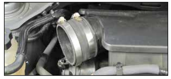
14. Install the provided coupler hose (08690) onto the intake plenum and secure with the provided hose clamp.