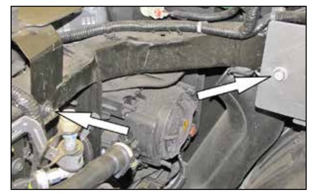
6. Remove the two factory bolts shown. NOTE: These bolts will be reused in a later step.

5. Lift up the air filter housing to dislodge it from the mounting grommets and then remove the complete air filter housing assembly from the vehicle. NOTE: K&N Engineering, Inc., recommends that customers do not discard factory air intake.