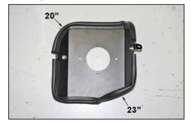
10. Install the provided edge trim onto the heat shield as shown.