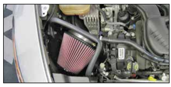
13. Install the heat shield assembly into the vehicle and secure with the hardware removed in step #6. NOTE: Do not completely tighten at this time.