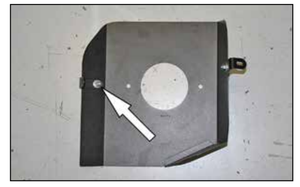
8. Install the heat shield mounting bracket (070712) onto the heat shield as shown using the provided hardware.