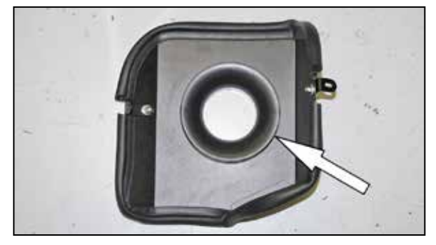
11. Install the filter adapter into the heat shield and