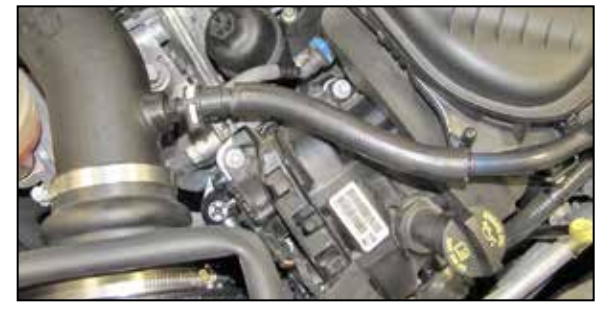
20. Install the factory quick disconnect fitting into the provided crank case vent hose and then install the assembly onto the factory hardline and connect the quick disconnect fitting to the fitting installed into the K&N<sup>®</sup> intake tube.