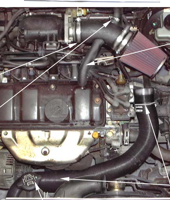
8. Secure the cold air hose to the radiator filler using a long tie ensuring that the hose clears the exhaust and radiator fan.

7. Carefully lengthen the flexi cold air hose to approx. 76cm / 30" and feed the hose across to the side of the radiator. Secure the top of the hose to the original intake pipe bracket using a plastic tie supplied.