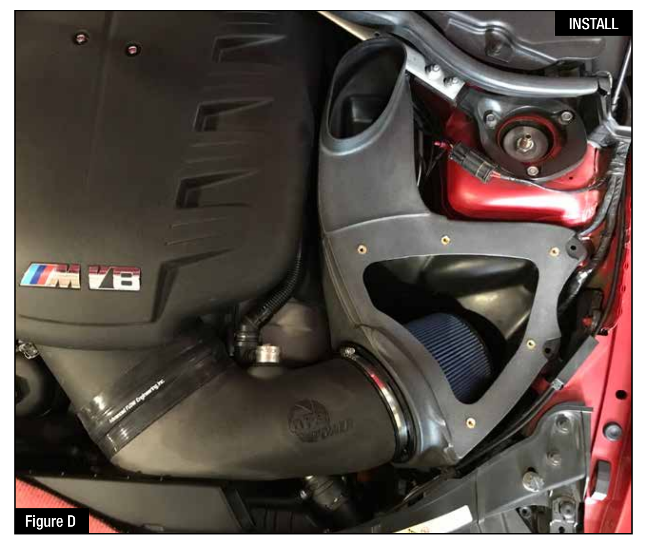
Refer to Figure D for Step 9.

Step 9: Carefully, guide the intake assembly into the engine bay.