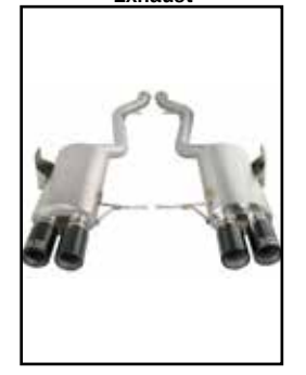
P/N: 49-36312-C (C/F Tips) 49-36312-P (Pol. Tips)