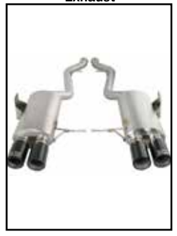
P/N: 49-36311-C (C/F Tips) 49-36311-P (Pol. Tips)