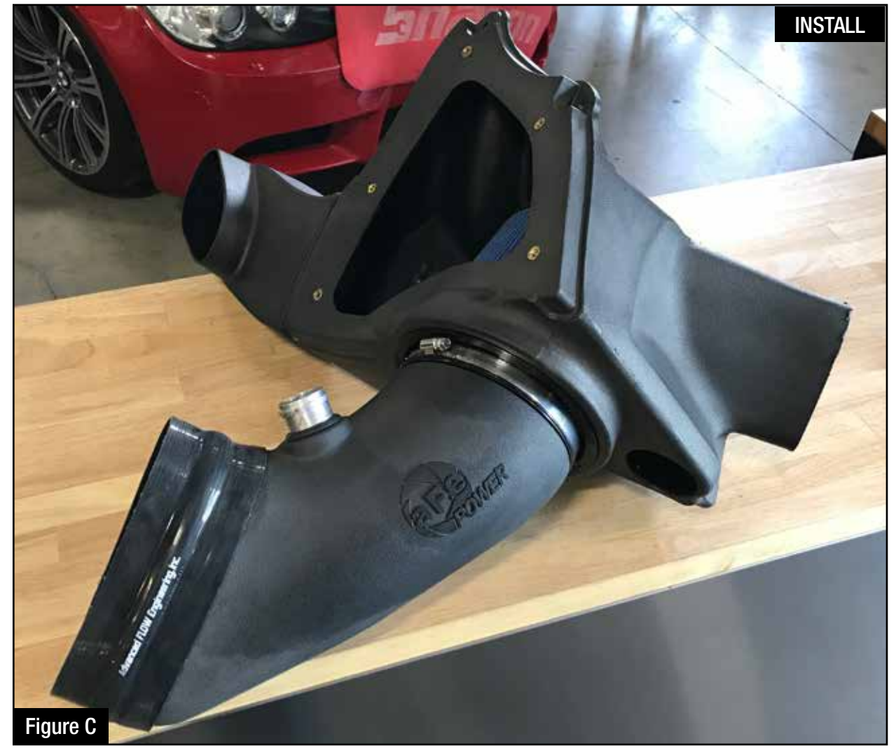
Refer to Figure C for Step 8.

Step 8: Insert the aFe filter and tube assembly into the aFe airbox.