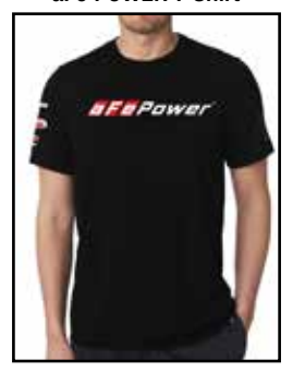
P/N: 40-30442-B (M) 40-30443-B (L)

54-11478-R (Red) 40-30443-B (L) To purchase any of the items above, view airflow charts, dyno graphs, photos, and video; please go to aFepower.com.