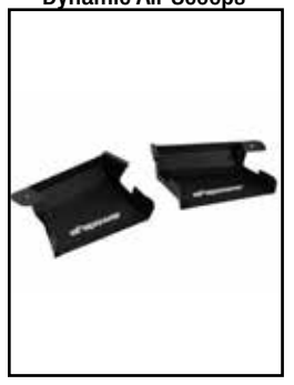
P/N: 54-11478 (Blk.)