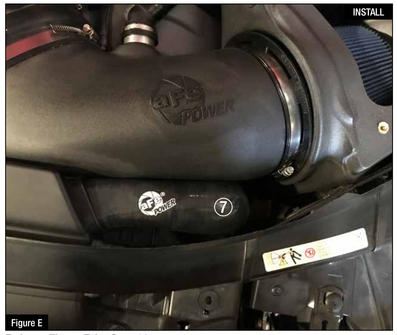
Refer to Figure E for Step 10.