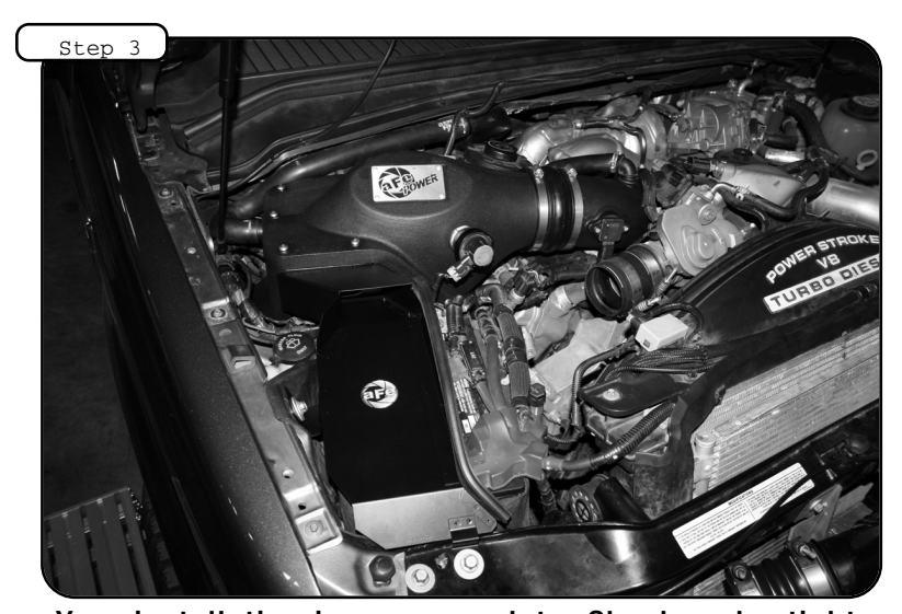
Your installation is now complete. Check and retighten connections and filter after a few hours of operation. Thank You for choosing aFe!