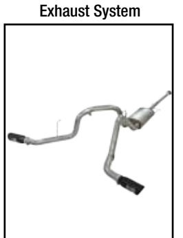
P/N: 49-43056-B (Blk Tips) 49-43056-P (Pol Tips)