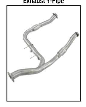
P/N: 48-43006 (Street) 48-43007 (Race)

To purchase any of the items above, view airflow charts, dyno graphs, photos, and video; please go to aFepower.com.