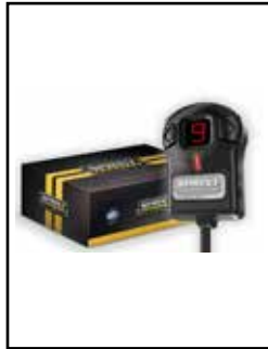
Sprint Booster V3

P/N: 49-38058 (No Reson.) 49-38059 (w/ Reson.)