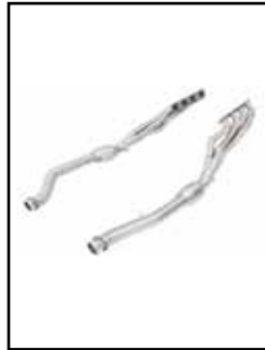
Long Tube Headers