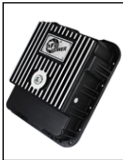
P/N: 46-70242 (Black) 46-70240 (RAW)