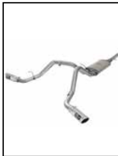
P/N: 49-44071-B (Blk. Tips) 49-44071-P (Pol. Tips)