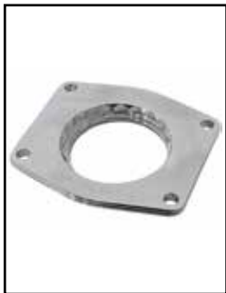
P/N: 46-34008 (For 5.3L)