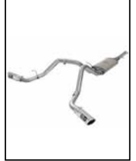
P/N: 49-44071-B (Blk. Tips) 49-44071-P (Pol. Tips)