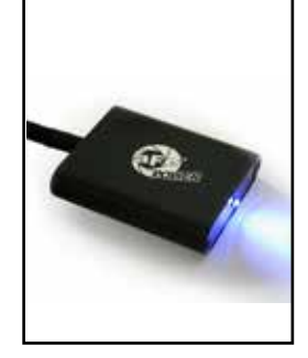
P/N: 77-46303 (N20/N26)