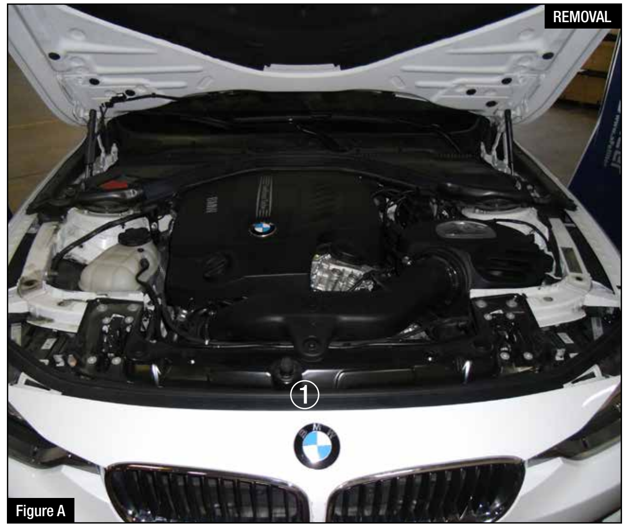
Refer to Figure A for Step 1.

Step 1: Remove the seal trim on the front bumper rail 1.