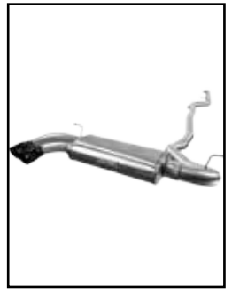
P/N: 49-46310-B (Blk. Tips) 49-46310-P (Pol. Tips) (N20 Engines Only)