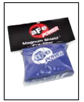
P/N: 28-10101 Yellow P/N: 28-10102 Red P/N: 28-10103 Black P/N: 28-10104 Blue