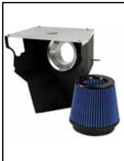
Air Intake System