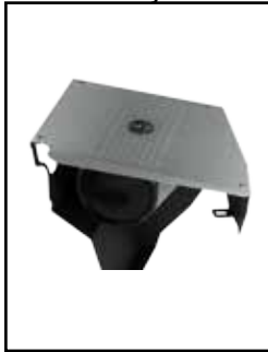
Air Intake System