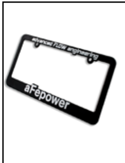
aFe License Plate Frame