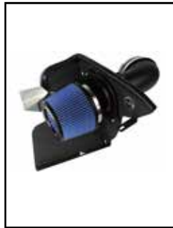
Air Intake System