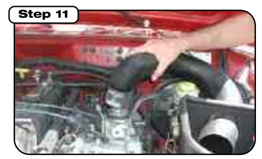
Slip coupler over throttle body.