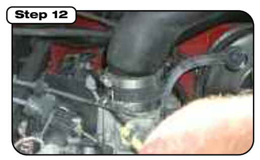
Install intake tube onto throttle body making sure tube is completely resting on throttle body to ensure proper hood clearance. Tighten clamps to