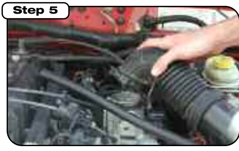
Loosen clamp at throttle body and remove.