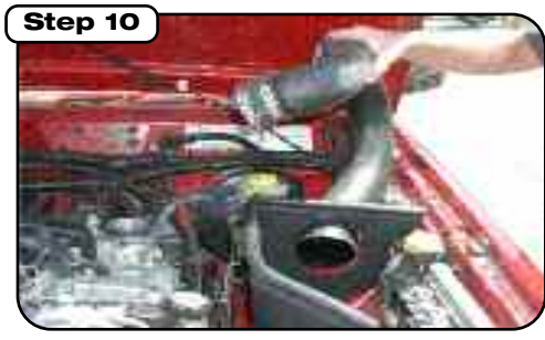
Attach coupler to intake at throttle body end. Then slide intake tube through filter housing starting with filter end of tube.