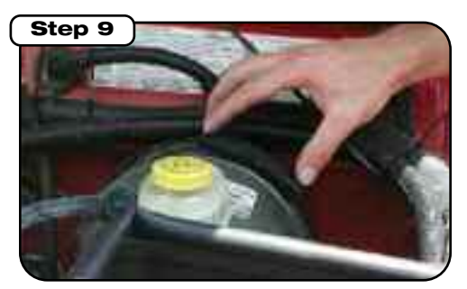
Looking straight at brake booster place center of isolation pad at 1 o'clock.