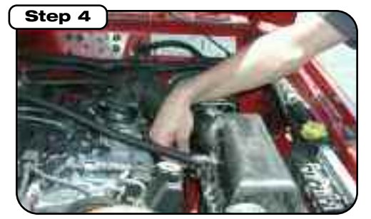
Remove top of OE air box.