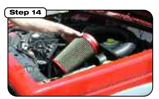
Install filter to intake tube and tighten clamp.