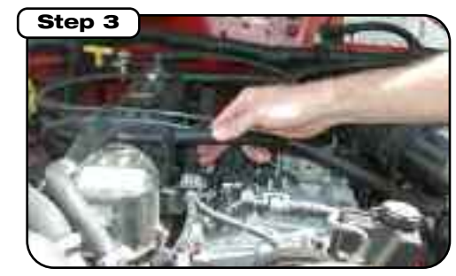
Remove breather tube from valve cover vent.