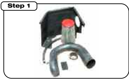
Complete kit with parts.