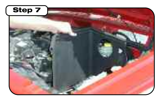
Prior to installing intake housing apply trim seal as shown to housing. Long piece to top edge and short piece lines hole. Place housing and mount. See step 8 for location(s).