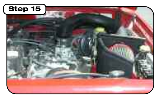
Place enclosed CARB EO sticker on a clean/smooth surface on or near the intake system. EO identification label is required in passing the Smog Check inspection. Make sure all hoses and clamps are tight and that all electrical components are secure.