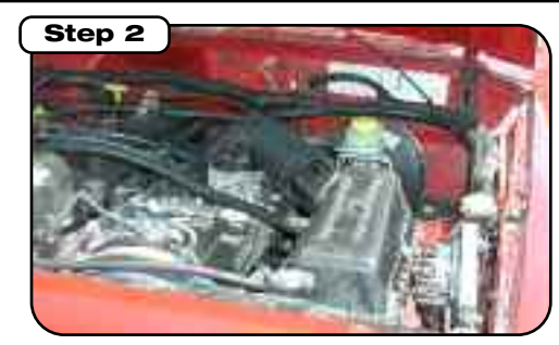
Complete stock intake.