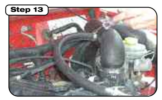
Connect supplied vent hose to nipple at intake tube and at breather vent tube and tighten clamps.