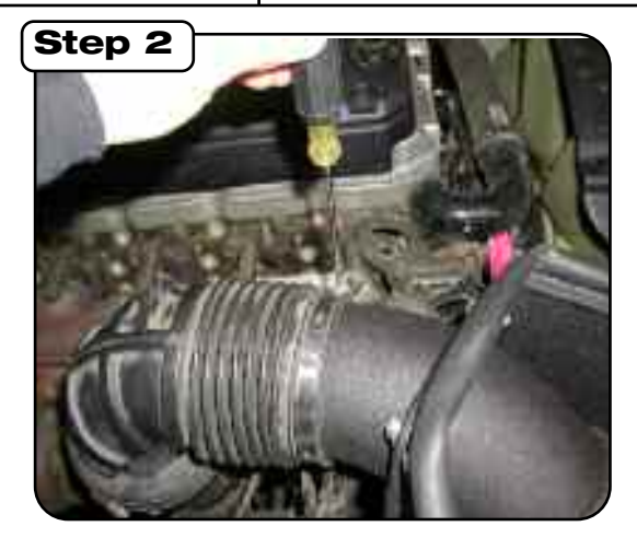
Loosen clamp for stock intake tube at turbo inlet and also loosen clamp at filter tube. Remove stock intake tube.