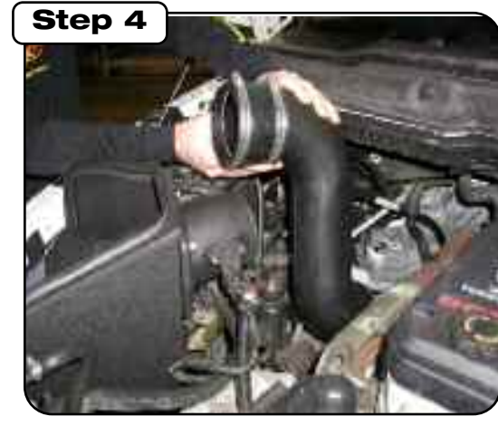
With longer (4" x 3") coupler slid onto the longer end of 419 tube, position the tube into place in the coupler on the turbo inlet. Then line up the top of tube and filter tube so you can slip the straight coupler over both tubes.