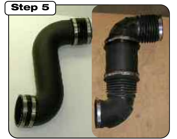
Compare the difference between stock and the Torque Booster Tube. Re-check clamps and connections and retighten after a few hours of operation.

NOTE:Retighten all connections after approximately 100-200 miles. Place enclosed CARB EO sticker on or near the device on a smooth/clean surface. EO identification label is required to pass the smog test inspection.