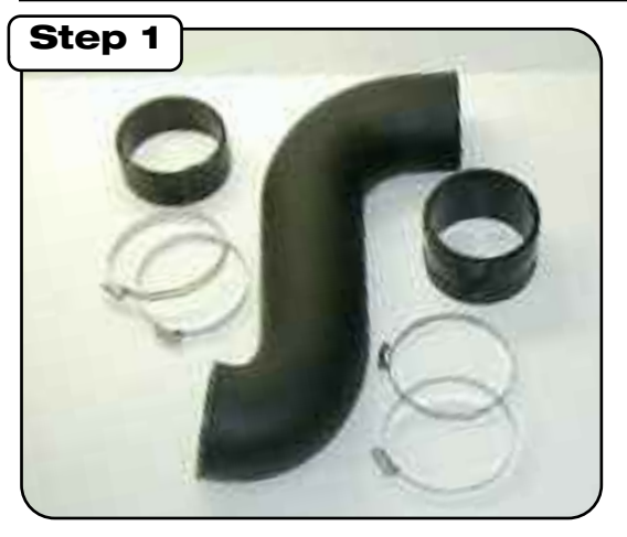
Complete Torque Booster Tube upgrade.