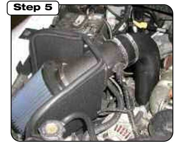
Once all pieces are set into place go through and tighten up all clamps.