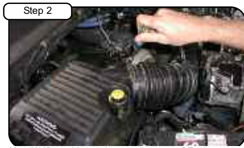
Use 5/16" nut driver to loosen clamps on OE tube at turbo/air box and remove.