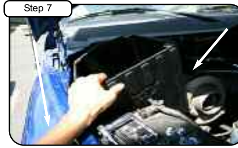
Install housing into vehicle and position.