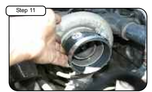
Install high temp coupler to turbo using clamps provided. Do not tighten.