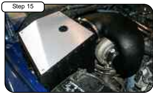
Your installation is now complete. Please check all clamps and hoses periodically and tighten. Thank you for choosing aFe!