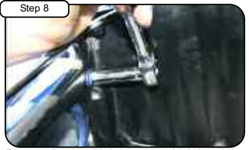
From step 5, re-install bolt through housing hole and tighten.