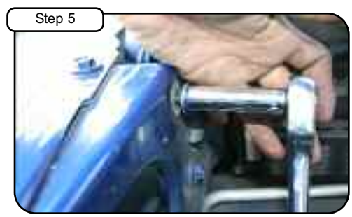
With 13mm socket or wrench remove top bolt on inner fender next to air inlet hole.