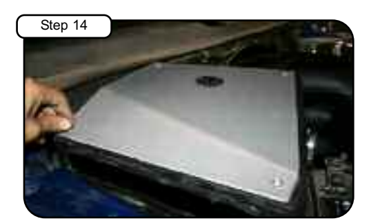
Install cover and tighten using button head screws provided. Tighten with 5/32" allen key.