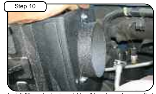
Install filter adaptor to outside of housing using supplied screws, washers, and nuts. Tighten with 7/16" socket or wrench.