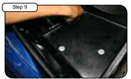
Secure housing using fender washers and nuts provided. Tighten using 7/16" socket or wrench.