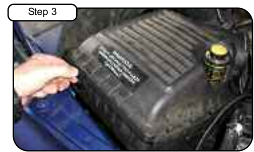
Un-clip upper half of air box and remove.