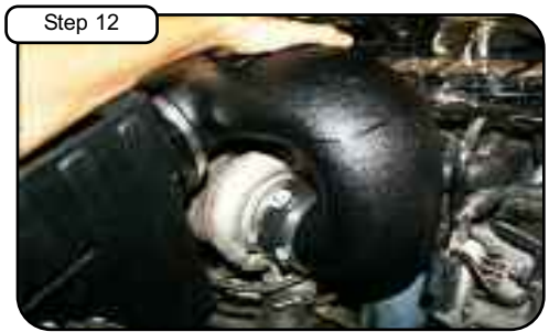
Attach 6" hump coupler with clamps provided to tube and install tube to turbo and filter adaptor. Adjust and tighten all clamps with 5/16" nut driver.