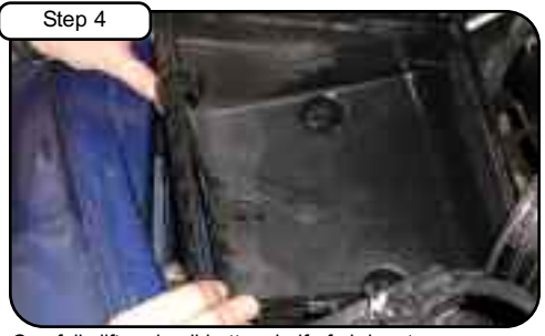
Carefully lift and pull bottom half of air box to remove from vehicle.