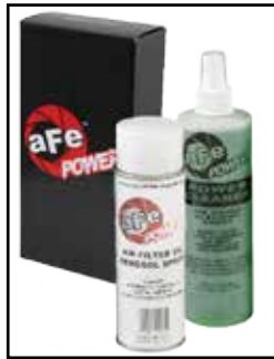
Blue Aerosol Restore Kit