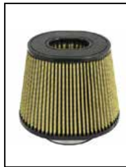
Pro-Guard 7 Air Filter