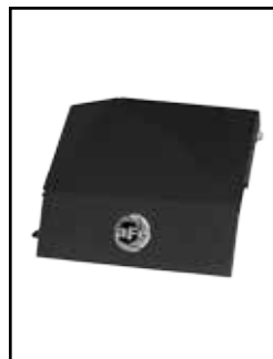
aFe Power Intake Cover