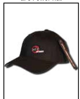
aFe Power Hat