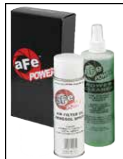
Blue Aerosol Restore Kit