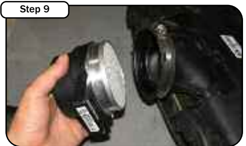
Step 9 Remove the MAF sensor from the OE air box.