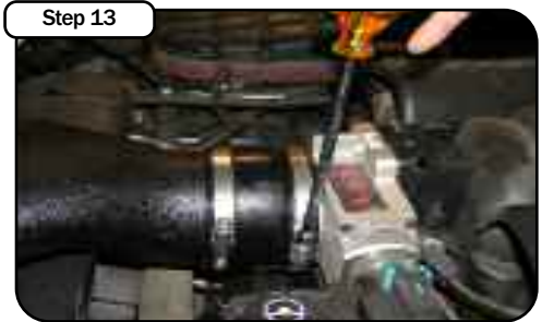
Step 13 Secure the coupler onto the throttle body and secure in position.