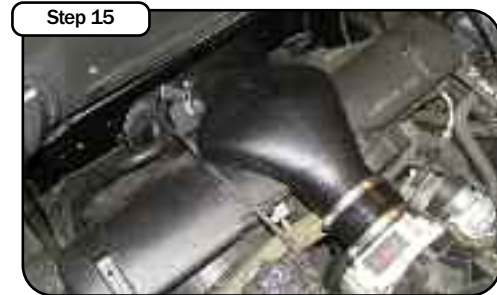
Step 15 Your installation is now complete. Make sure you tighten all clamps and check all electrical connections. Re-check periodically. Place the included CARB EO Sticker on or near the intake system on a smooth, clean surface. E.O. identification label is required in passing the Smog Check inspection.