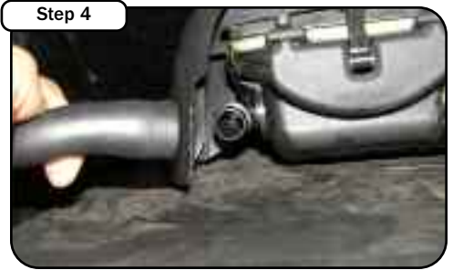
Step 4 Unplug the air breather hose.