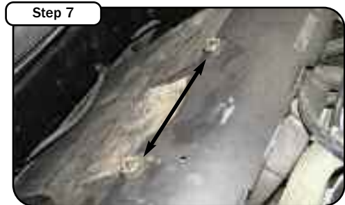
Step 7 Place the two rubber grommets on the two pins located on the engine cover.