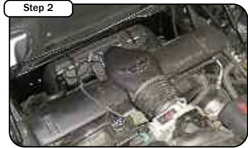
Step 2 Complete stock intake.