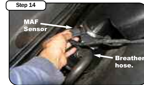
Step 14 Reconnect the MAF sensor and air inlet hose to the air filter.