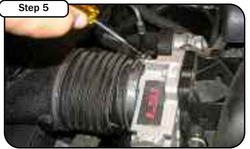
Step 5 Loosen the clamp holding the OE intake tube to the throttle body.