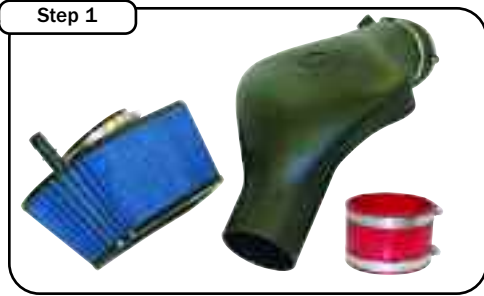
Step 1 Complete kit. Make sure all components listed are included prior to beginning installation.