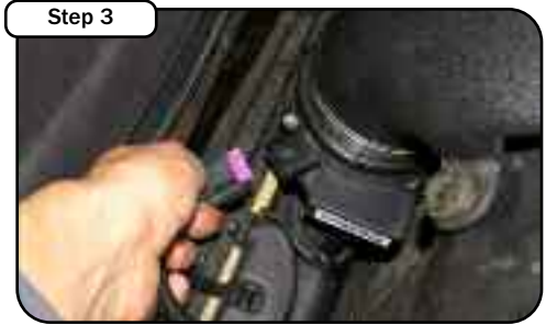
Step 3 Remove MAF sensor plug.