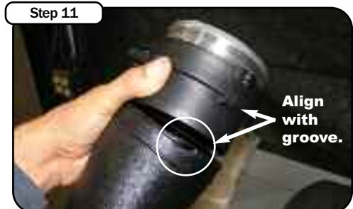
Step 11 Insert the MAF sensor into the aFe intake tube. Make sure to align the MAF sensor to the notch on the intake tube. This assembly requires a snug fit. If fit is too tight the tube can be heated with a hair dryer or heat gun to allow insertion.