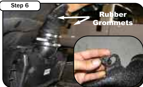
Step 6 To remove stock housing lift up and pull out. Remove the two rubber grommets on the OE intake tube. Store these items for future use if needed.