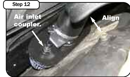
Step 12 Insert the air hose inlet coupler into the air filter. Sit the intake into position aligning the two rubber grommets with the dimples on the aFe intake tube.