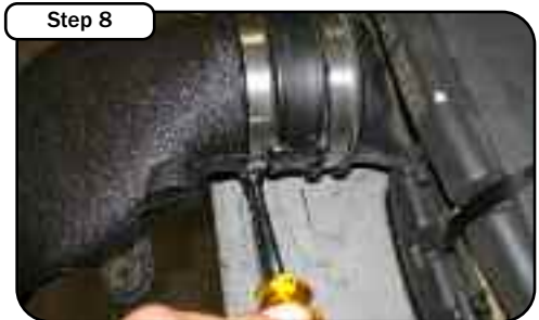
Step 8 Loosen the clamps holding the OE intake tube to the OE air box. Remove the tube.