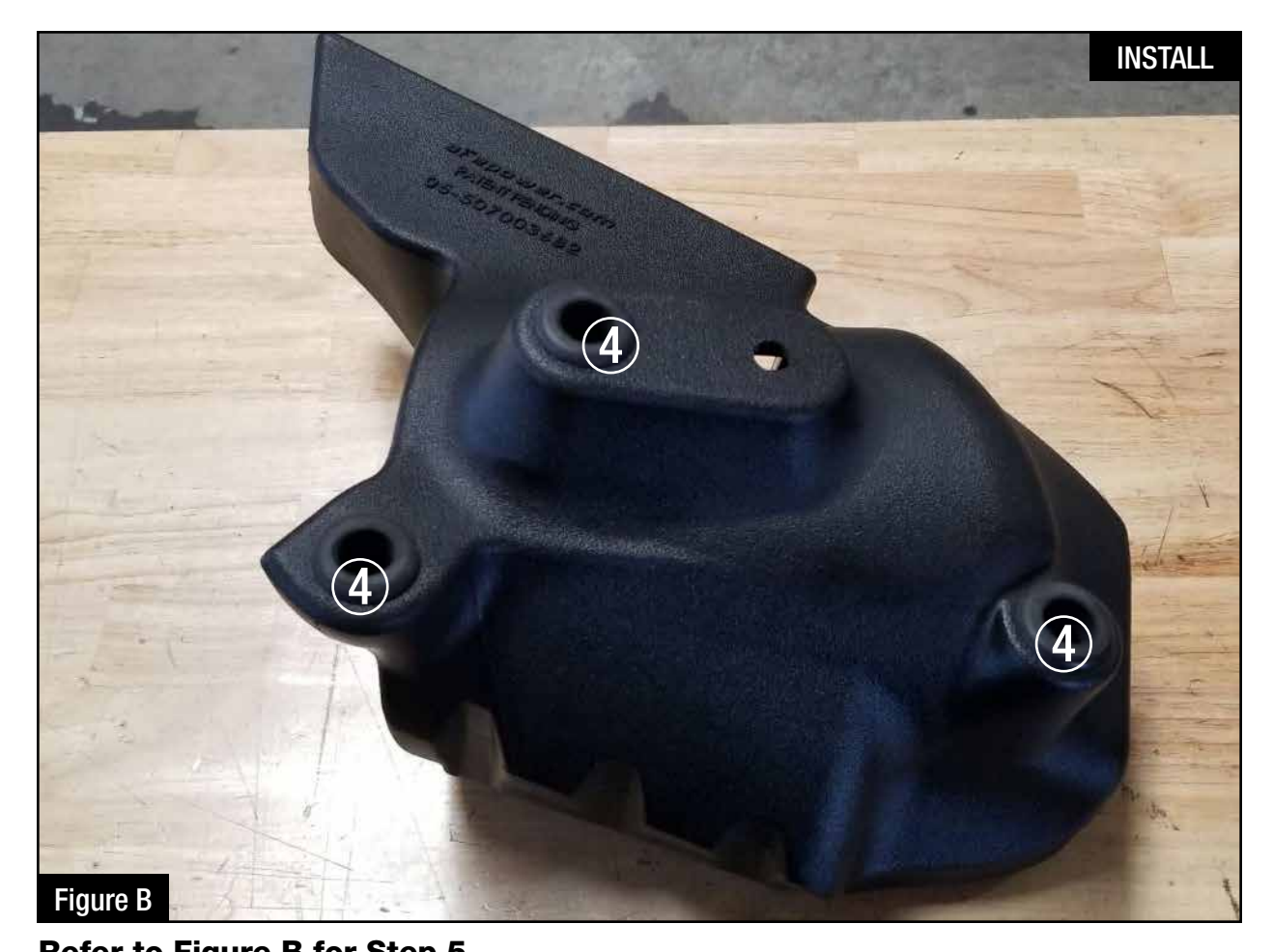
Refer to Figure B for Step 5 Step 5: Install the three (x3) provided rubber grommets 4 on the bottom of the aFe POWER air box as shown.