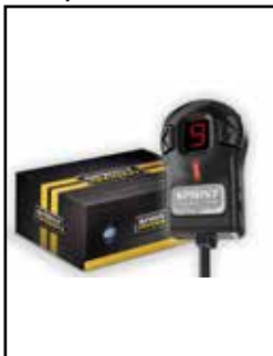
Sprint Booster V3