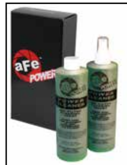
Pro DRY S Restore Kit