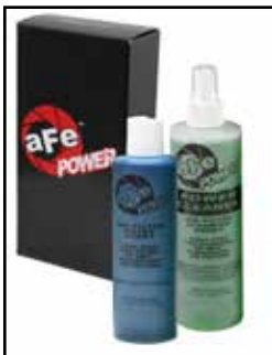
Blue Squeeze Restore Kit