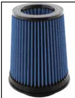
Pro 5R Air Filter