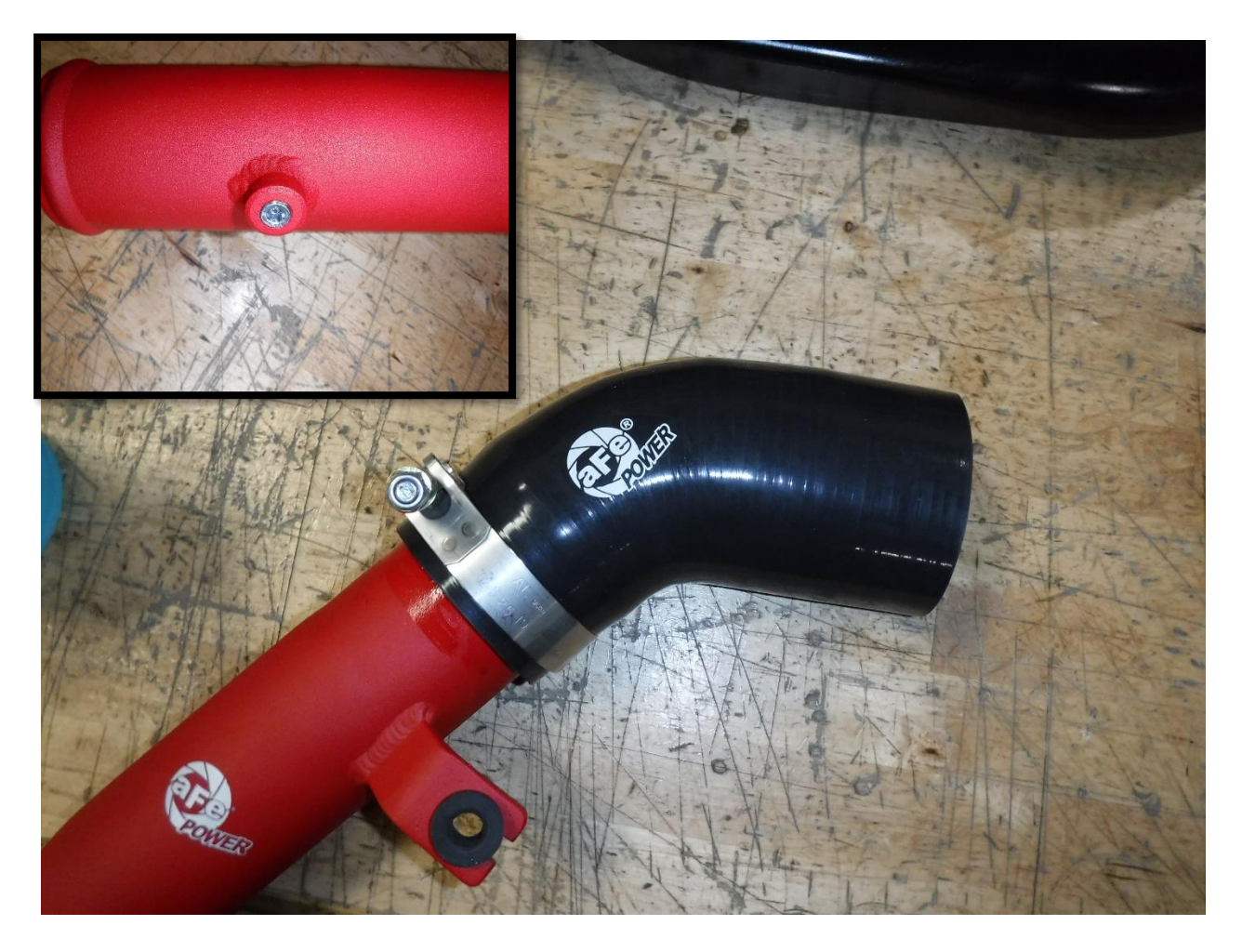
Note: Be sure to use thread sealant on the plug or sensor to prevent any leaking