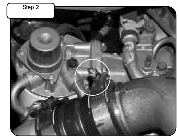
With 7/16" deep socket, loosen clamp on manifold.