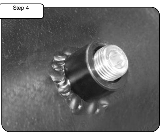
Install plugs in to 1/8" NPT ports with 3/16" hex key. Use teflon pipe sealant tape for leak tight fit.