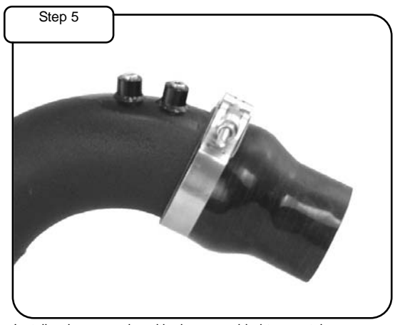
Install reducer coupler with clamp provided to new tube.