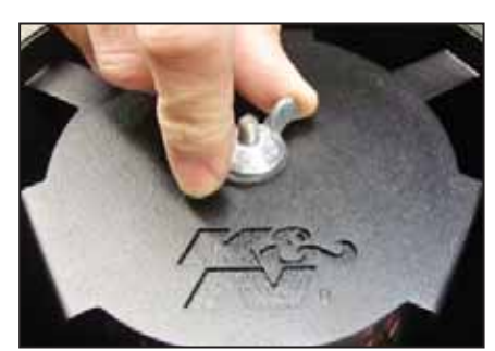
Fig. 1 Fig. 2