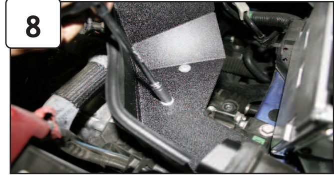
Install housing into vehicle and position. Secure hous-ing using provided M6 screws and flat washers. Tighten using 10mm socket or wrench.