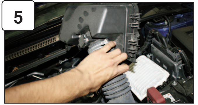
Remove upper half of air box and stock tube assembly.