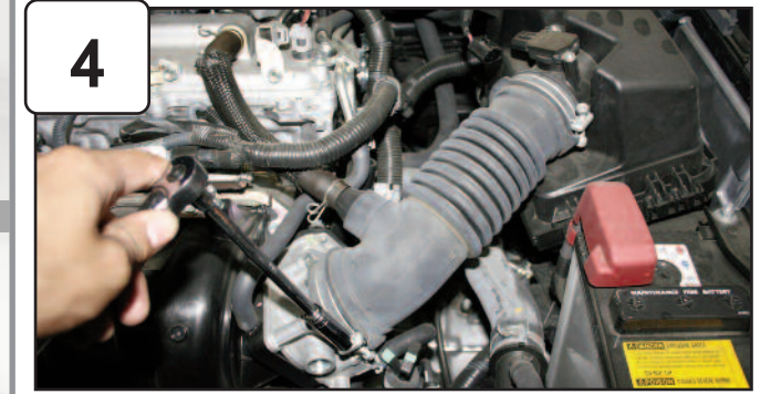
With 10mm socket or wrench loosen clamp on throttle body. Disconnect MAF sensor harness. Remove crank case line.