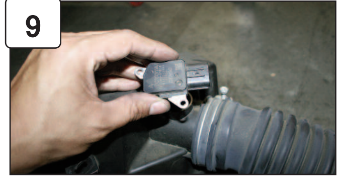
Remove MAF sensor using phillips screwdriver.