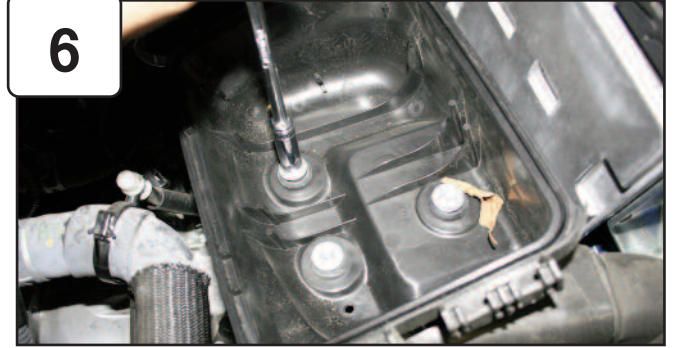
With 10mm socket or wrench, carefully remove bottom air box assembly out of vehicle. Pull back harness on back of air box.