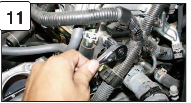
Loosen bolt on side of engine using 13mm socket or wrench.