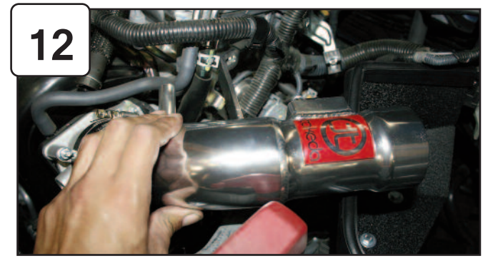
Install intake assembly and position. Do not tighten.