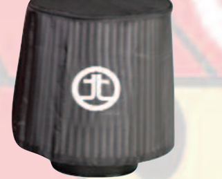
Pre Filter P/N: TP-7011B

Note: Filter Cleaning: When cleaning your Pro Dry S ™ filter, be sure to use only "Restore Kit" (Takeda P/N: TP-7015C Pro Dry S ™ cleaner only.)