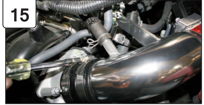
Tighten all clamps using 5/16" nut driver. Connect crank case line to tube.