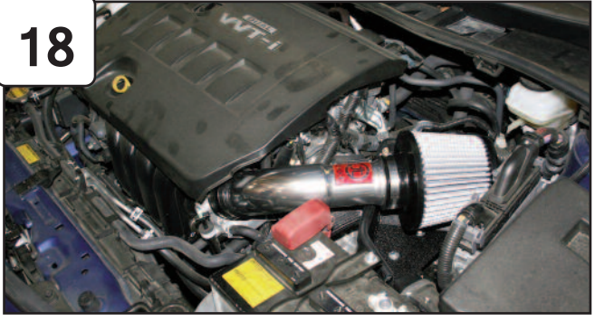
The installation of your Takeda performance intake is now complete. Please check all components and retighten if necessary. Thank you for choosing Takeda!