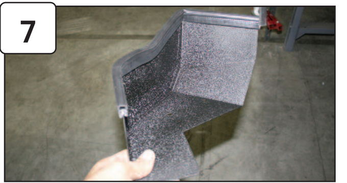
Attach trim seal to housing.

Note: Read instructions before installation and have tools ready.