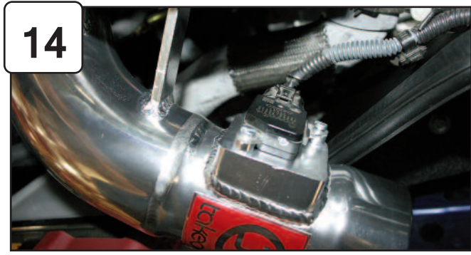
Re-connect MAF sensor harness.