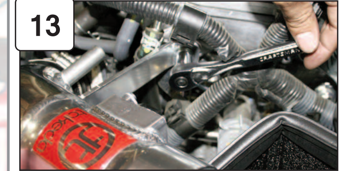
Secure tab on tube to engine. Re-install bolt from step 11 and tighten.

For replacement part(s) or "Restore Kit" please log on to takedausa.com P.O. Box 1719 Corona CA, 92878