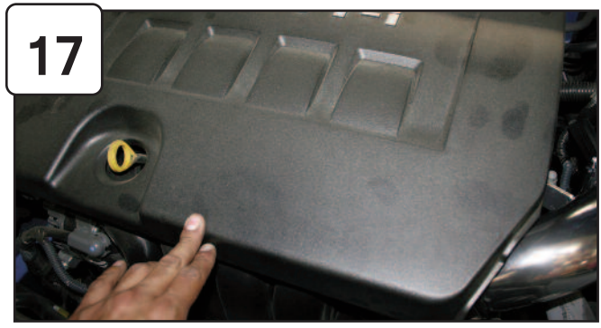
Re-install engine cover. Re-connect battery terminals.

Attach air filter to tube and tighten using 5/16" nut driver.