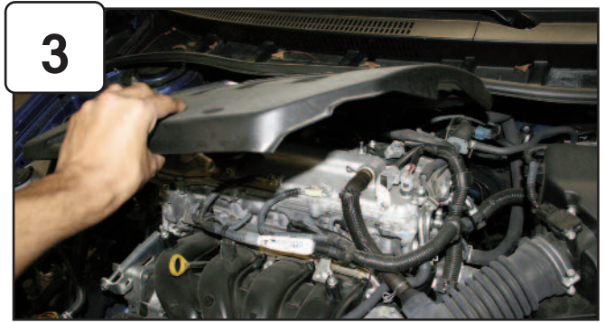
Remove engine cover.