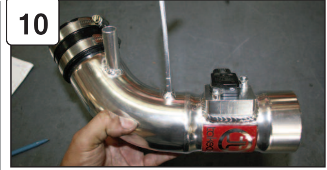
With provided M4 screws, install MAF sensor to new intake tube. Attach 05-00570 coupler with clamps to tube.