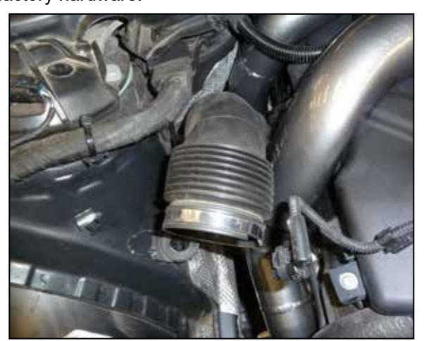
14. Install the factory intake tube onto the turbo inlet and secure with the factory clamp.