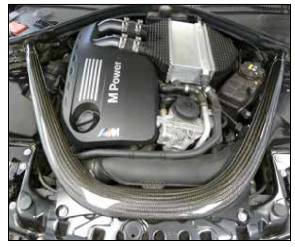
17. Reinstall the strut tower brace and covers, secure with the factory hardware.