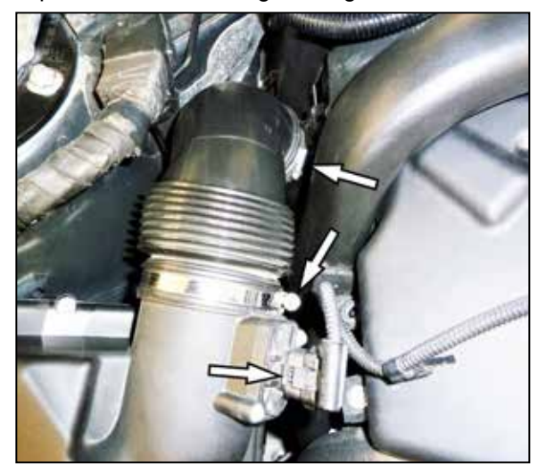
5. Disconnect the maf sensor electrical connection. Loosen the hose clamp that secures the factory intake tube to the air filter housing and then remove the air filter housing from the vehicle. Loosen the hose clamp that secures the factory intake tube to the turbo inlet pipe and then remove the tube from the vehicle. Stuff a towel into the turbo inlet pipe to prevent debris from falling into the turbo.