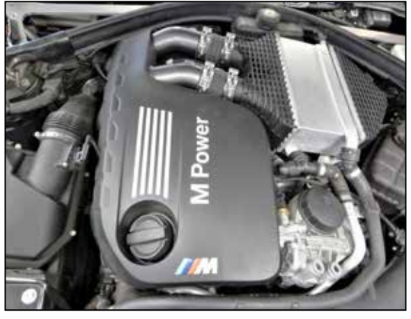
16. Reinstall the engine cover and oil fill cap.