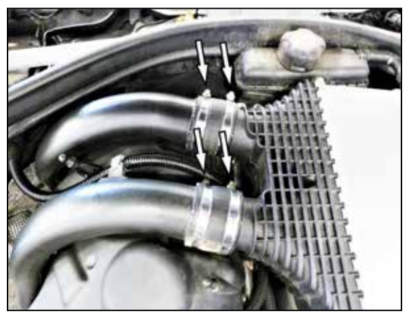
7. Loosen the four hose clamps the secure the factory charge tube hoses to the intercooler.