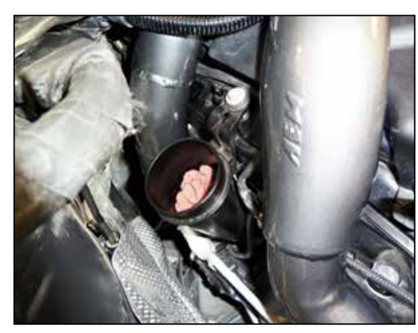
13. Reinstall the turbo inlet and secure with the factory hardware.