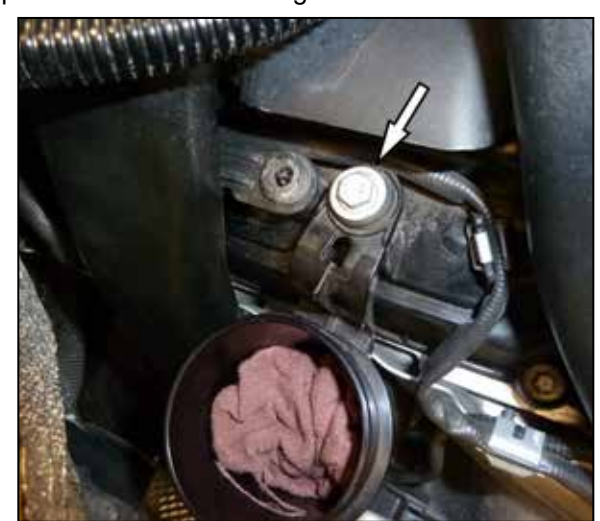
6. Remove the bolt that secures the turbo inlet pipe and then disconnect the pipe from the turbo and remove it from the vehicle.