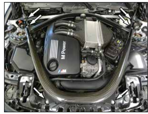
3. Remove the six bolts that secure the strut tower brace and then remove the brace from the vehicle.