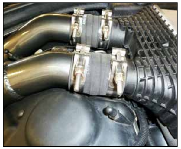
12. Slide the couplers onto the intercooler inlets, position the hose clamps and then tighten.