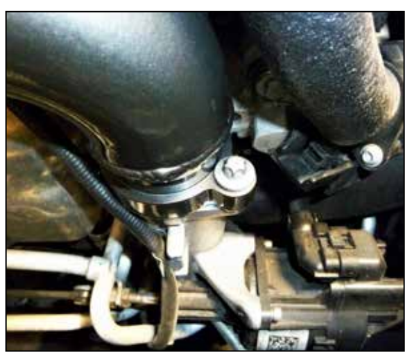
11. Install the AEM charge pipes onto the turbo and secure with the factory hardware from step #8.