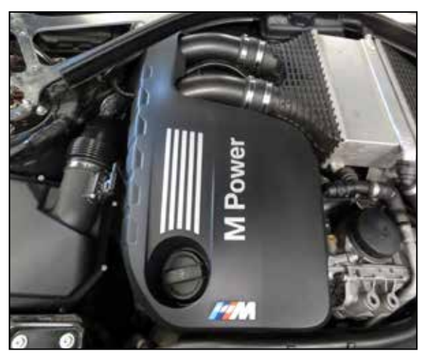
4. Remove the oil fill cap and then lift off the engine cover. Reinstall the oil fill cap or use a towel to keep debris from entering the engine.