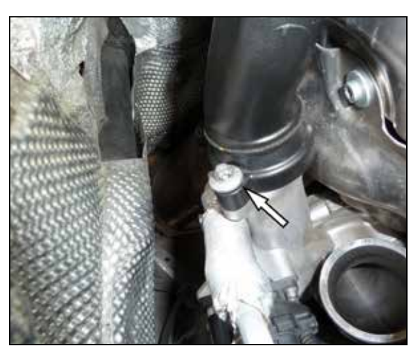
8. Remove the bolts that secure the factory charge tubes to the turbo and then remove the charge tubes from the vehicle. NOTE: The following size wrenches can be used to remove the TORX bolts, T50 TORX, 5/16" 12-point wrench, 8mm 12-point wrench.