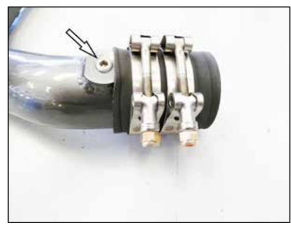
10. Install the provided 1/8npt accessory port plugs into the AEM charge tubes. NOTE: be sure to apply pipe sealant on the threads of the plugs. Install the provided couplers and clamps onto the charge tubes. NOTE: Slide the couplers all the way onto the pipes as shown as this will aid the installation of the pipes.