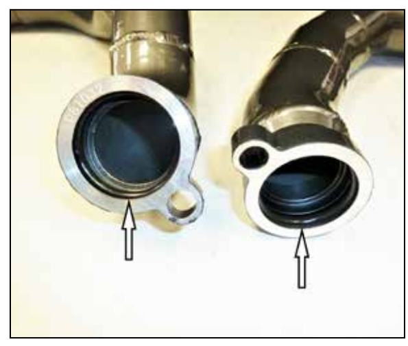
9. Remove the O-rings from the factory charge tubes and install them into the AEM charge tubes.