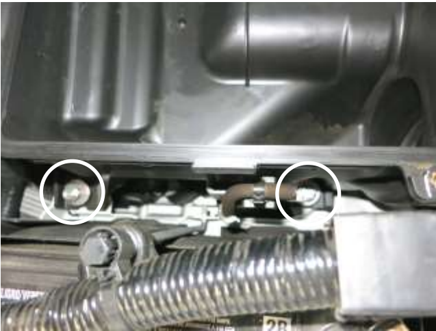
g. Loosen the (2) bolts that secure the lower air box to the vehicle.