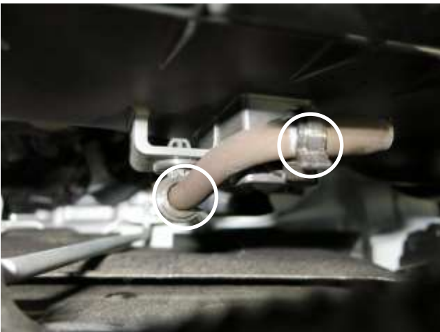
i. Located in the front of the lower air box, remove the vent hose from the clips.