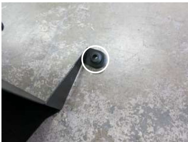
c. Install the rubber grommet into the AEM heat shield that was removed in step 2m.