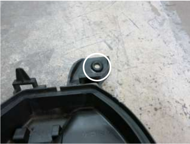
m. Remove the grommet from the lower air box. Note: Sometimes this can get stuck on the vehicle instead of the lower air box. This will be reused in step 3c.