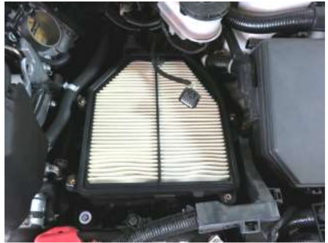
f. Lift the upper air box and stock intake hose out of the vehicle. Then, remove the stock air filter.