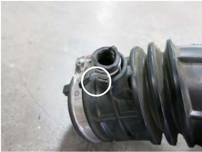
l. Release the pressure off the spring clamp and remove it from the stock intake hose. Note: This will be re-used in step 3b.