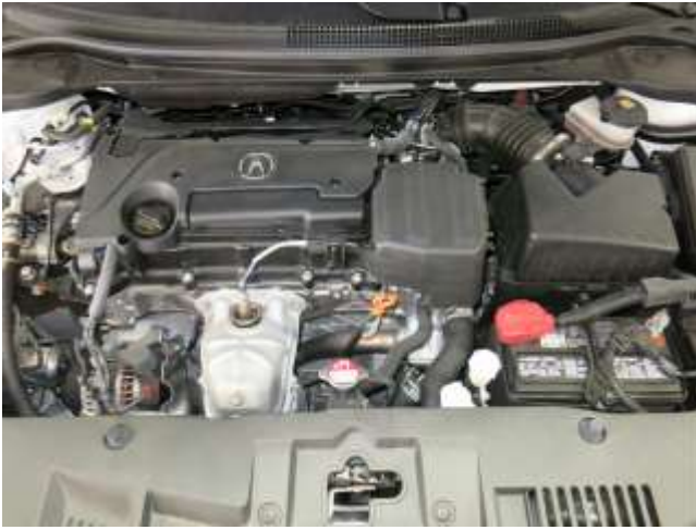
STOCK INTAKE INSTALLED