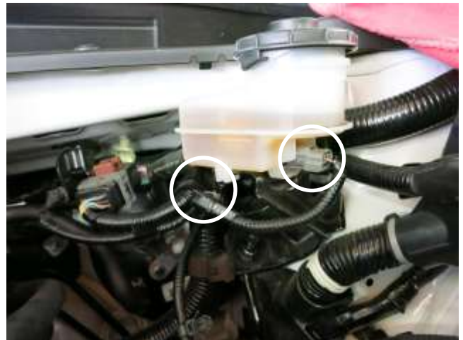
j. Disconnect the electrical connector and the clip securing the wire loom to the brake reservoir.