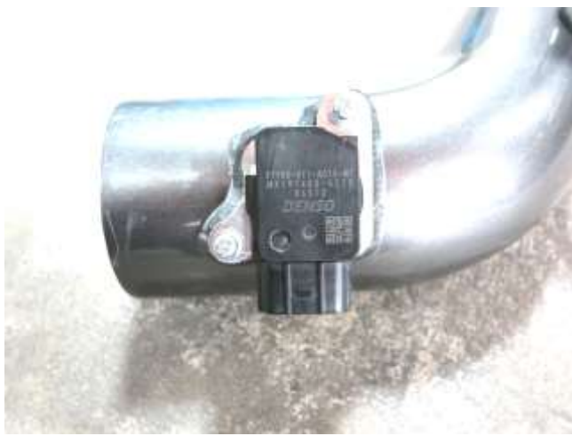
a. Install the MAF sensor and screws into the AEM intake tube that were removed in step 2n.

a. When installing the intake system, do not completely tighten the hose clamps or mounting hardware until instructed to do so.