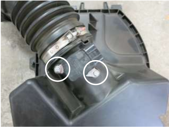
n. Remove the screws securing the MAS to the upper air box lid. Note: The MAS and screws will be re-used in step 3a.