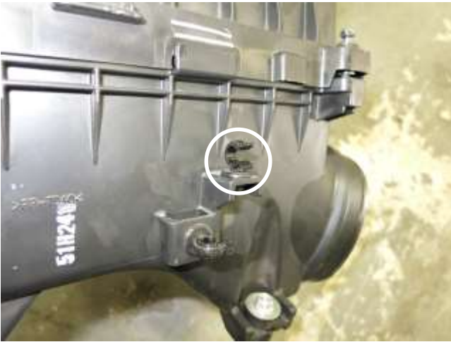
o. Remove the clip on the front of the lower air box by squeezing the tabs together. Note: This will be reused in step 3f.