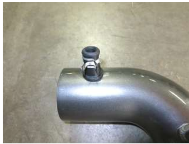
b. Install the supplied PCV adapter and the spring clamp removed in step 2l. into the AEM intake tube.