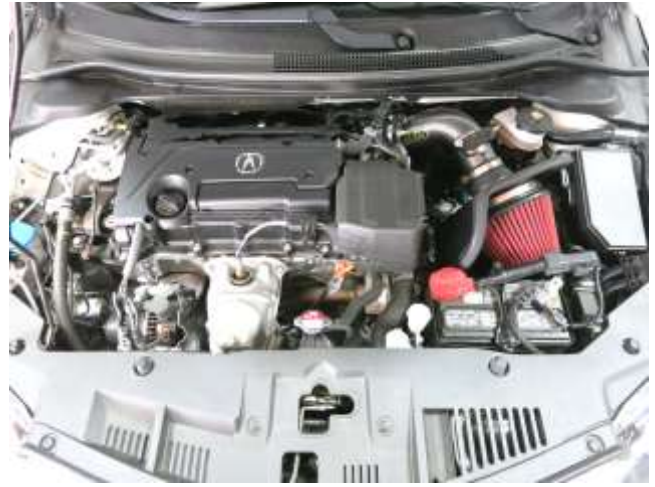
AEM INTAKE INSTALLED