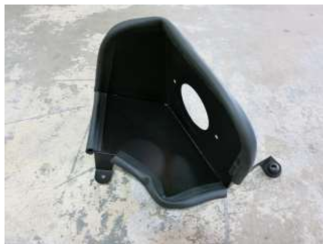
d. Install the supplied edge trim around the heat shield as shown and trim off excess if necessary.