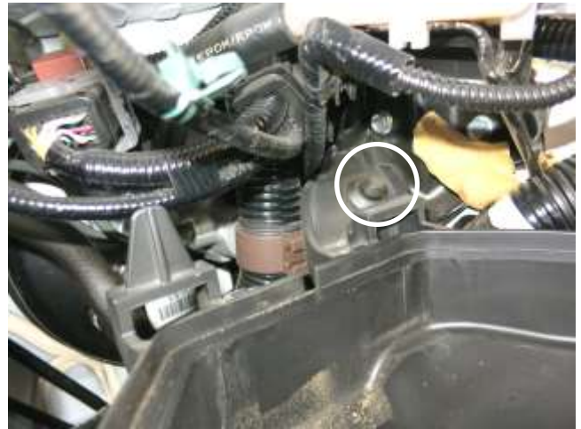
h. Pull the rear of the lower air box off the push in grommet located underneath the brake fluid reservoir. Note: Soapy water can help disengaging the grommet from the stud.