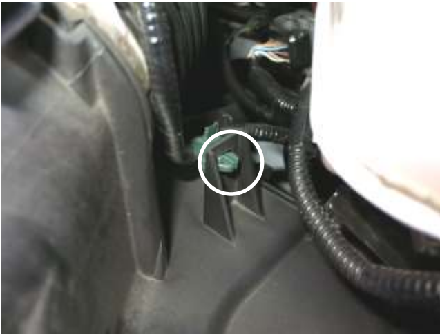
e. On the upper air box, disconnect the push-in tab that secures the MAF sensor wire loom to the upper air box.