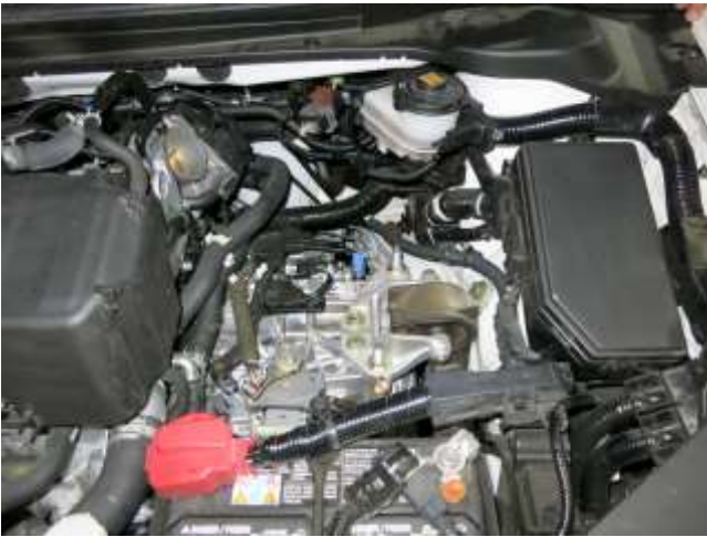
k. Remove the lower air box from the vehicle.