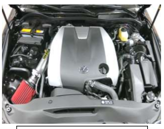
p. Finished installation of AEM Intake System.