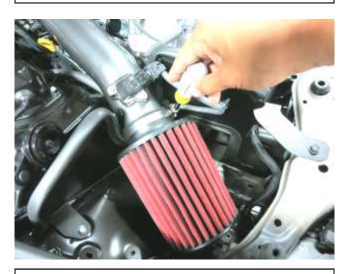
j. Install the AEM filter onto the inlet end of the tube. Adjust for clearance and secure down with the provided hose clamp(9452).

h. Align the mounting bracket as shown. Fasten the M8 bolt installed from step 3c using a 13mm wrench.