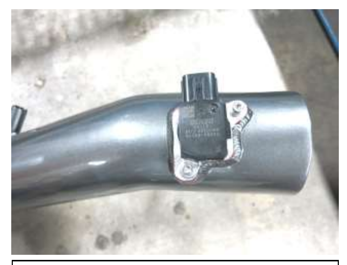
a. Reinstall the MAF sensor into the AEM tube and fasten using the provided bolts(07733).

a. When installing the intake system, do not completely tighten the hose clamps or mounting hardware until instructed to do so.