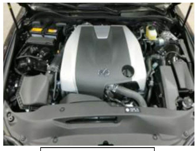
o. Factory air induction system.