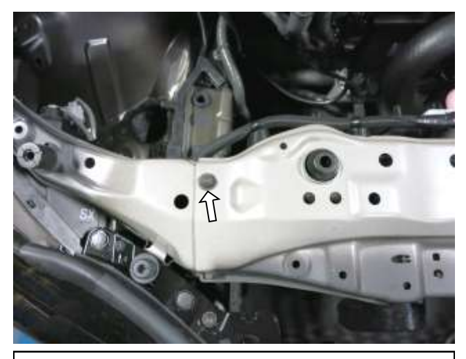
b. Remove the indicated bolt using a 10mm socket. Set this bolt aside for use with the AEM heat shield installation.