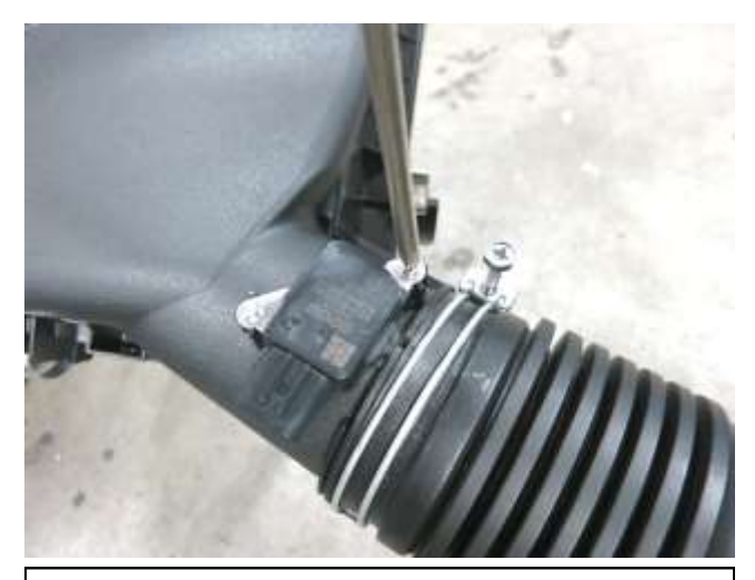
h. Use a Philips screwdriver to remove the MAF sensor from the stock intake tube.