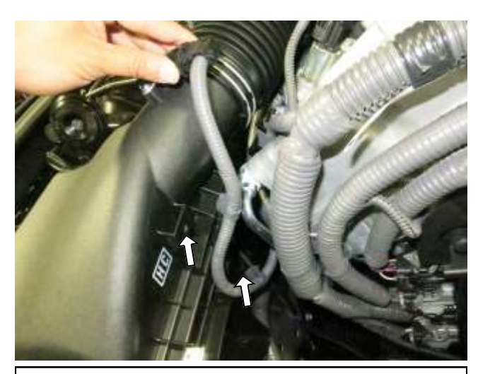
d. Disconnect the two tree mount clips securing the MAF harness to the stock airbox. Unclip the harness from the MAF sensor as shown.

b. Depress the 8 plastic clips indicated and remove the plastic upper fascia.