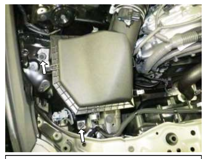
f. Loosen and remove the two M6 bolts indicated.

g. Loosen the hose clamp and slide the stock tube off the throttle. Remove the stock intake system.