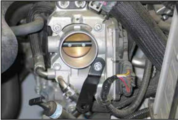
12. Install bracket (#06510) onto the throttle body stud and secure with the nut removed in the previous step.