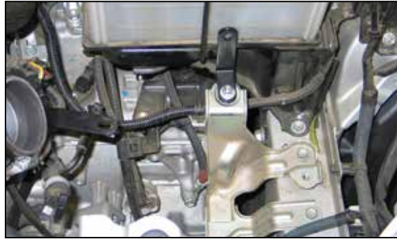
16. Install bracket (#07093) onto the lower air box support bracket with the provided hardware as shown. NOTE: Do not completely tighten at this time.