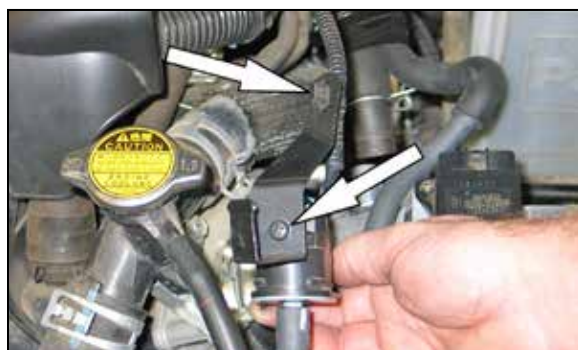
21. Remove the screw that secures the vacuum switching valve to the bracket. Un-clip the wiring harness from the bracket as shown.