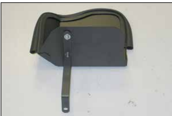
15. Install bracket (# 07925) onto the heat shield with the provided hardware as shown.