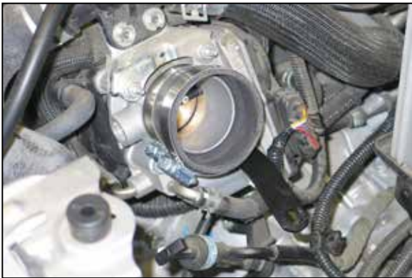
13. Install silicone hose (#08476) onto the throttle body and secure with the provided hose clamp as shown.