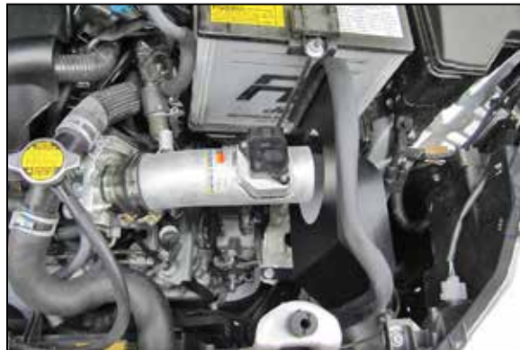
20. Install the K&N® intake tube into the silicone hose at the throttle body and align with the tube bracket and heat shield. Secure with the provided hardware as shown.