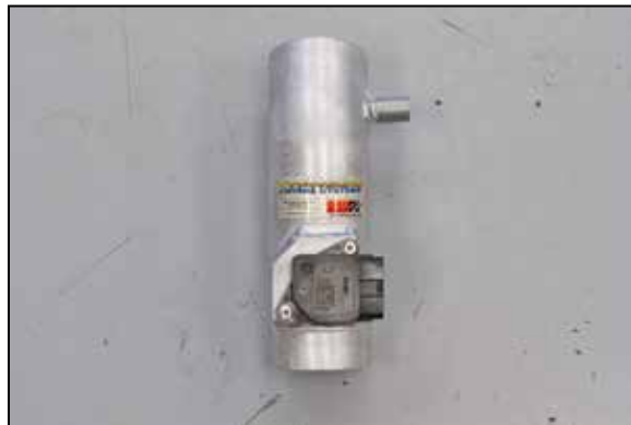
19. Install the mass air sensor into the K&N® intake tube with the provided hardware as shown.