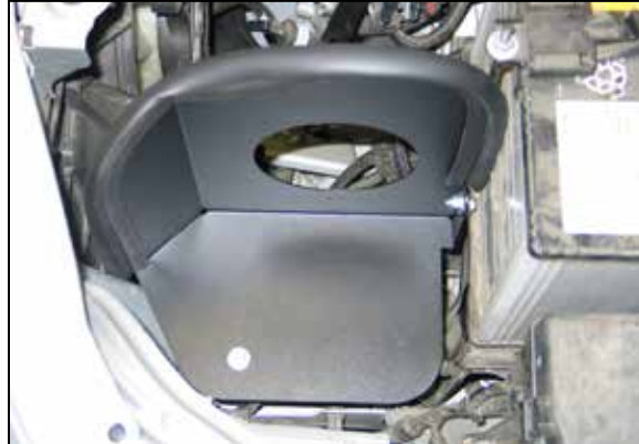
17. Install the heat shield assembly and secure it with the provided hardware as shown.