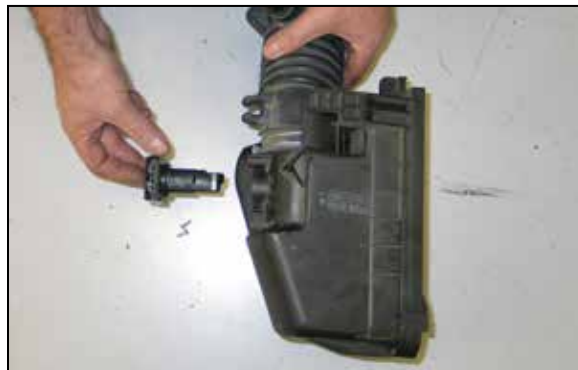
18. Remove the two screws that secure the mass air sensor to the upper air box assembly, then remove the mass air sensor as shown.