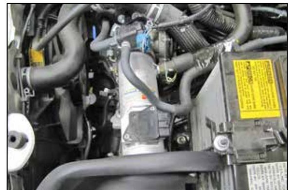
25. Install the crank case vent line onto the K&N® intake tube using the spring clamp removed in step # 4 (as shown).