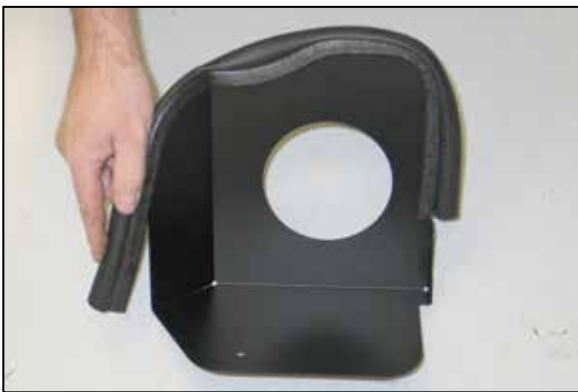
14. Install the provided edge trim onto the heat shield as shown. NOTE: Some trimming of the edge trim may be necessary.