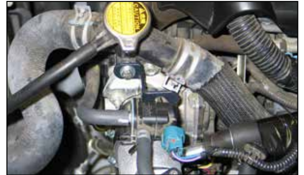
24. Install the vacuum switching valve assembly onto the radiator fill neck support with the provided hardware as shown.