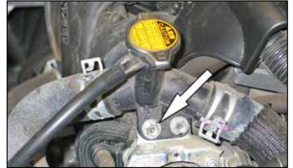
23. Remove the bolt securing the radiator fill neck to the radiator fill neck support (as shown).