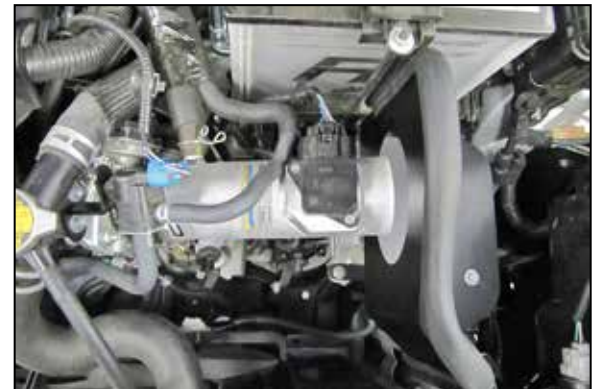
26. Re-connect the mass air sensor electrical connector as shown.