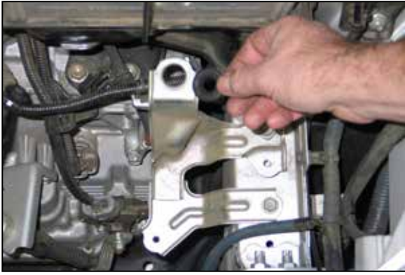
10. Remove the lower air box grommet as shown.