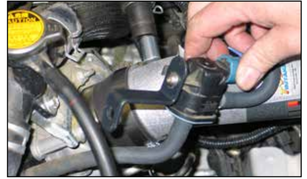
22. Install bracket (#07958) onto the vacuum switching valve with the provided hardware as shown.