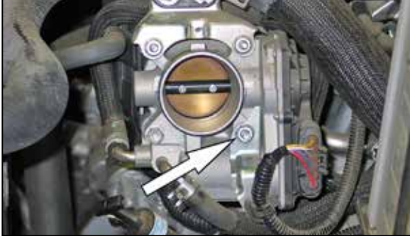
11. Remove the lower inboard nut securing the throttle body to the manifold as shown. NOTE: The nut will be re-used in the next step.