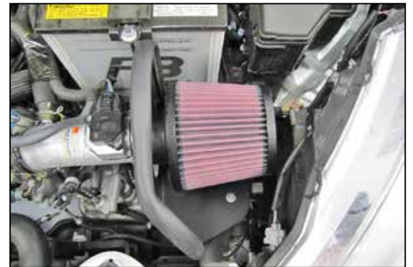
27. Install the K&N® air filter as shown. NOTE: Drycharger® air filter wrap; part # RX-4990DK is available to purchase separately. To learn more about Drycharger® filter wraps or look up color availability please visit http://www.knfilters.com .