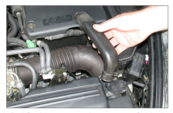
8. Pull firmly to remove the computer fresh air tube as shown.