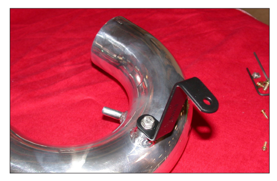
26. Secure the "Z" bracket to the threaded boss on the Typhoon intake tube using the provided hardware as shown.

NOTE: Before installing the "Z" bracket, inspect the inside of the tube for any debris, then clean the inside out with water and a towel. Inspect the tube one more time before proceeding to the next step.