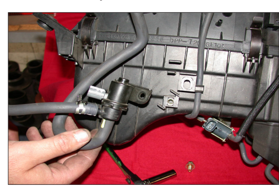
21. Loosen and remove the EVAP OBD canister closed valve from the air cleaner assembly as shown.