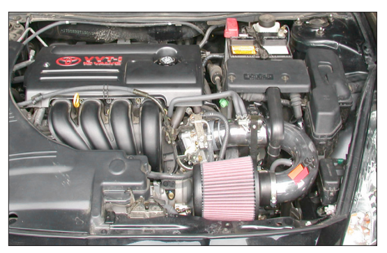
46. Reconnect the vehicle's negative battery cable. Double check to make sure everything is tight and properly positioned before starting the vehicle.