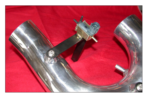
27. Secure the "L" bracket to the threaded boss on the Typhoon intake tube using the provided hardware as shown.

NOTE: Before installing the "Z" bracket, inspect the inside of the tube for any debris, then clean the inside out with water and a towel. Inspect the tube one more time before proceeding to the next step.