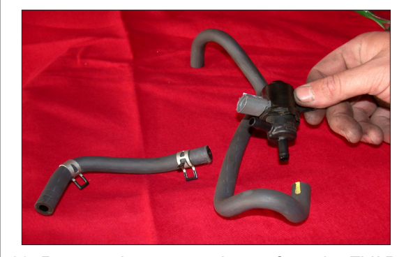
23. Remove the two vent hoses from the EVAP OBD canister closed valve as shown.