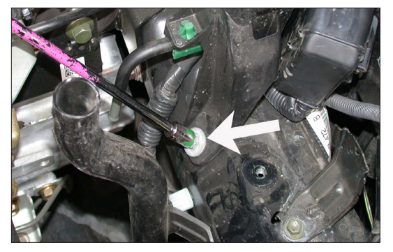
29. Loosen and remove the stock nut on the relay and fuse box support bracket as shown.