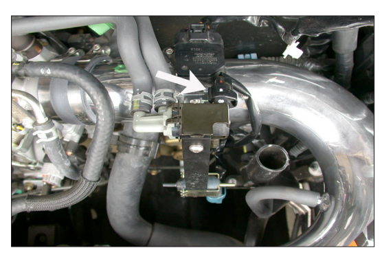
40. Reconnect the PWM vacuum switching valve electrical connection as shown.