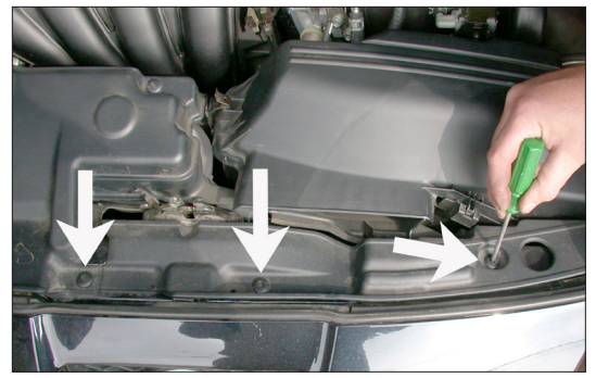
3. Depress the center pins on the push clips on the radiator core support cover as shown.