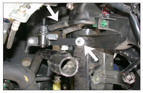
31. Install the EVAP OBD canister closed valve assembly into the vehicle and connect the hose to the hard line, then, secure the bracket to the relay and fuse box support bracket using the nut removed in step 29.