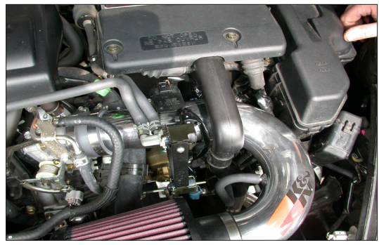
44. Install the computer fresh air tube as shown.