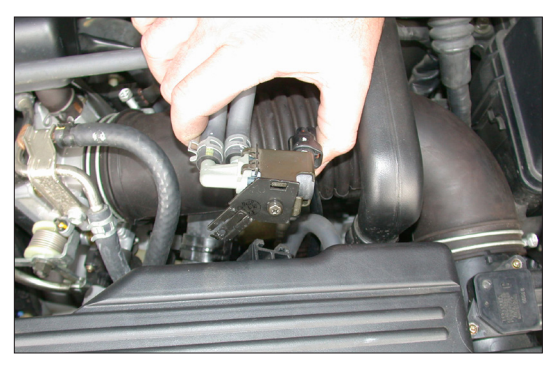
7. Unclip the PWM vacuum switching valve from the rear of the air cleaner assembly as shown.