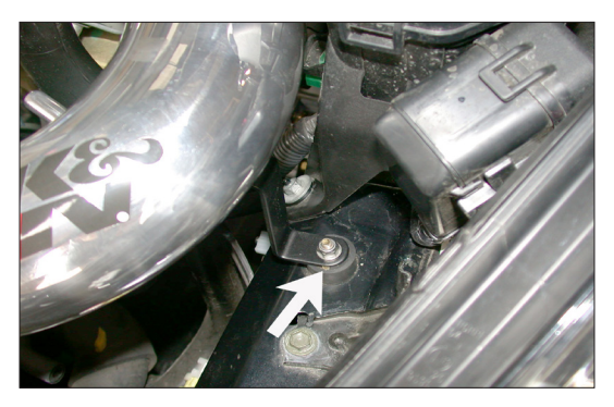
36. Line up the "Z" bracket with the rubber mounted stud and secure it with the provided hardware as shown.