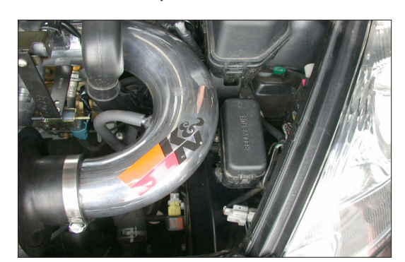
45. Slide the relay and fuse box back onto the stock bracket as shown.