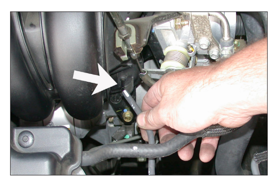
13. Remove the vacuum hose from the intake manifold as shown.