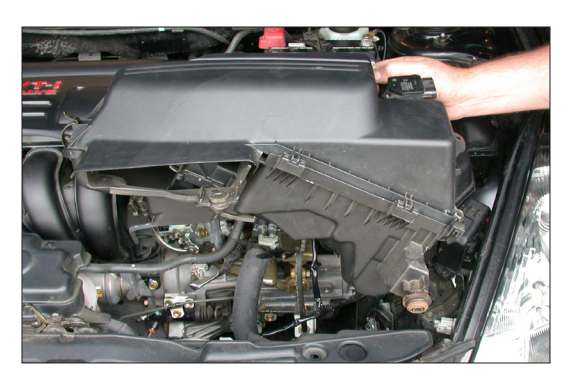
17. Remove the complete air cleaner assembly as shown.