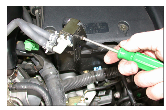
19. Remove the stock bracket from the PWM vacuum switching valve as shown.