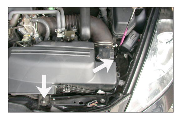
6. Loosen and remove the bolts that secure the air cleaner assembly as shown.