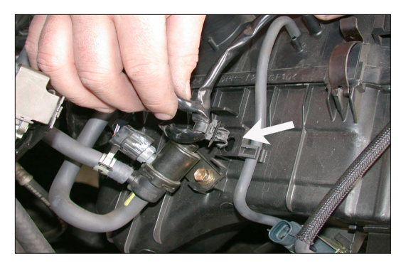
15. Using a pair of pliers unclip the wire harness from the back of the air cleaner assembly as shown.