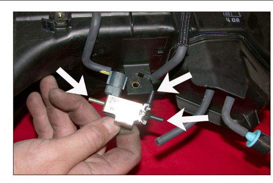
22. Disconnect the vacuum hoses from the vacuum switching valve, then, remove the vacuum switching valve from the bottom of the air cleaner assembly as shown.