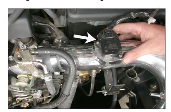
35. While sliding the intake tube into the silicone hose on the throttle body, reconnect the mass air sensor electrical connection as shown.