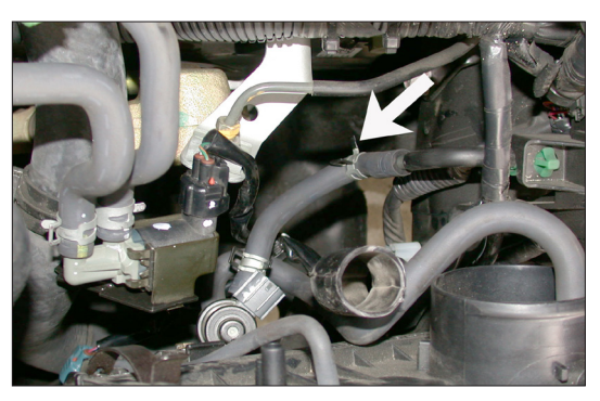
11. Remove the EVAP OBD canister closed valve vent hose from the hard line as shown.