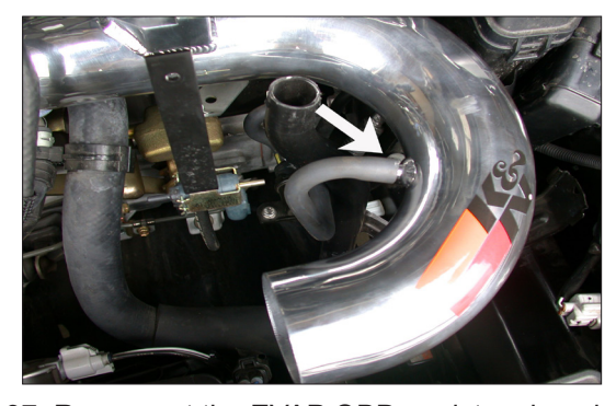
37. Reconnect the EVAP OBD canister closed valve vent hose to the vent on the intake tube as shown.