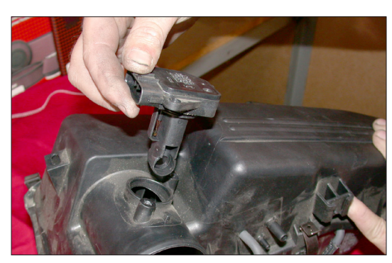
20. Remove the mass air sensor from the air cleaner assembly as shown.