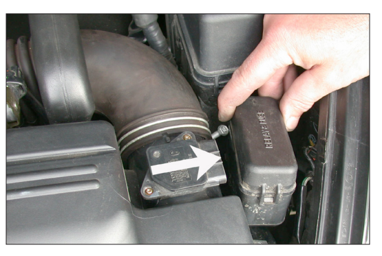
5. Unclip the relay and fuse box and move it out of the way as shown.