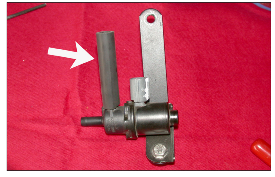
30. Connect the provided silicone hose onto the EVAP OBD canister closed valve as shown.