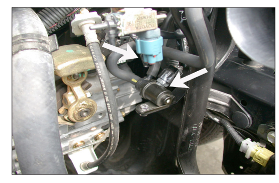
38. Reconnect the EVAP OBD canister closed valve electrical connection and the vacuum switching valve electrical connections as shown.