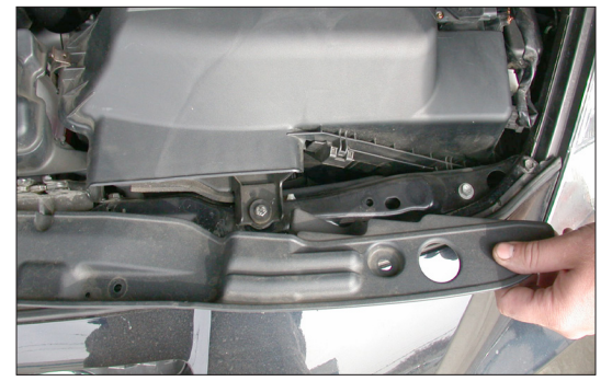
4. Remove the radiator core support cover as shown.