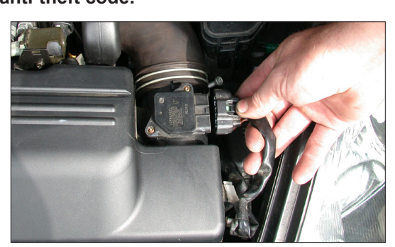
2. Disconnect the mass air sensor electrical connection.

NOTE: Disconnecting the negative battery cable erases pre-programmed electronic memories. Write down all memory settings before disconnecting the negative battery cable. Some radios will require an anti-theft code to be entered after the battery is reconnected. The anti-theft code is typically supplied with your owner's manual. In the event your vehicles' anti-theft code cannot be recovered, contact an authorized dealership to obtain your vehicles anti-theft code.