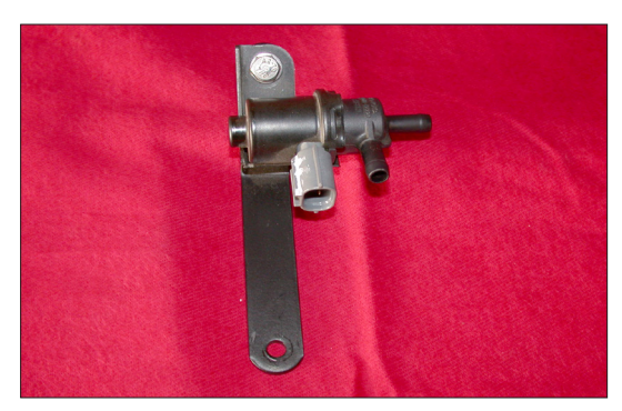
24. Secure the EVAP OBD canister closed valve to the provided angle bracket using the provided hardware as shown.