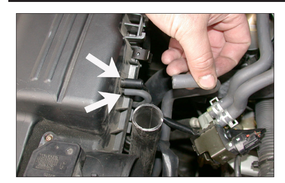
10. Remove the two stock rubber hoses from the air cleaner lid as shown.