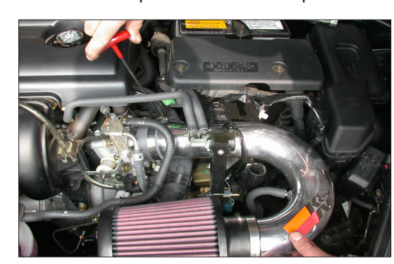
43. Adjust the tube for best fit and clearance and tighten all hardware and hose clamps as shown.