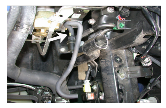
33. Reconnect the vent hose removed in step 23 to the EVAP OBD canister closed valve as shown.