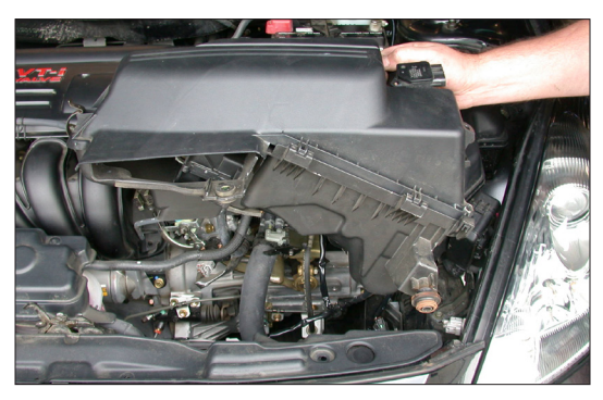
12. Push back, and pull up to gain access to the bottom of the air cleaner assembly as shown. NOTE: K&N Engineering, Inc., recommends that customers do not discard factory air intake.