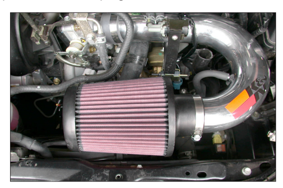
42. Install the air filter onto the intake tube and secure with the provided hose clamp as shown.