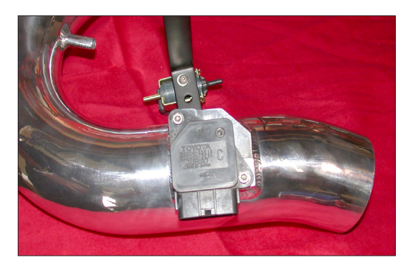
28. Install the mass air sensor into the intake tube and secure using the provided hardware as shown.