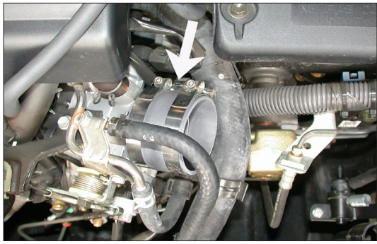
32. Install the silicone hose and hose clamps onto the throttle body as shown.