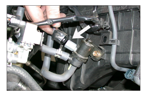
16. Disconnect the EVAP OBD canister closed valve electrical connection as shown.