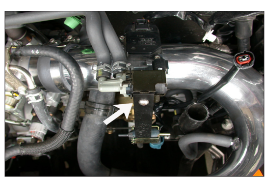
39. Secure the PWM vacuum switching valve to the "L" bracket using the provided hardware as shown