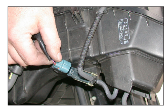
14. Disconnect the vacuum switching valve electrical connection as shown.