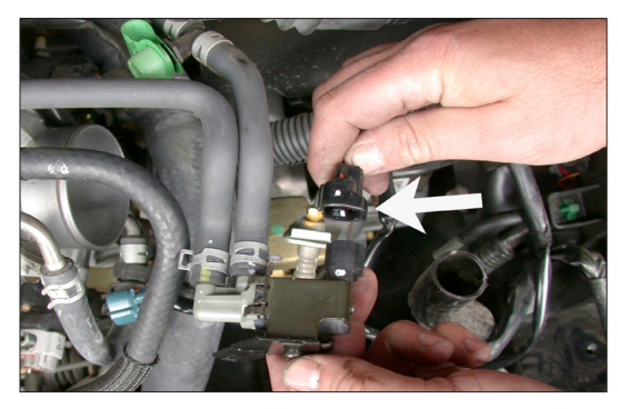
18. Disconnect the PWM vacuum switching valve electrical connection as shown.