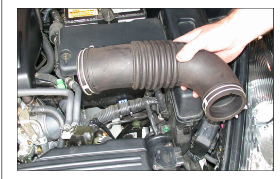
9. Loosen the hose clamps on the stock intake tube, then, remove the stock intake tube as shown.