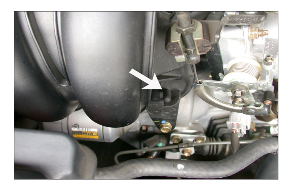
41. Cap the vent on the intake manifold using the provided rubber plug as shown.