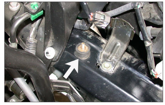
34. Install the provided rubber mounted stud into the existing air cleaner mounting hole as shown.