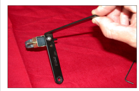
25. Secure the vacuum switching valve to the provided "L" bracket using the provided hardware as shown.