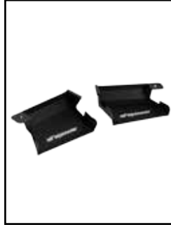
Dynamic Air Scoop

P/N: 54-11478 (Black) P/N: 54-11478-L (Blue) P/N: 54-11478-R (Red)