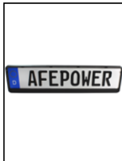
German Lic. w/ Frame